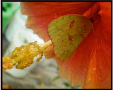
Shelter , photograph