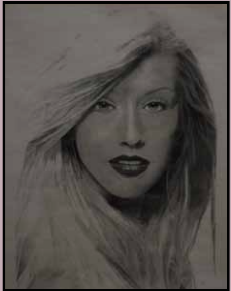
Christina Aguilera , pencil