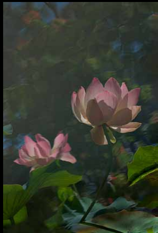
hoa-sen-web, Revenue Audit