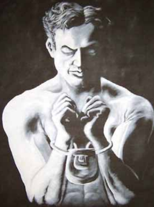
Houdini , oil and acrylic Chase Warren, Class of 2012