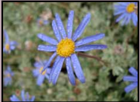
Wet petals , photograph