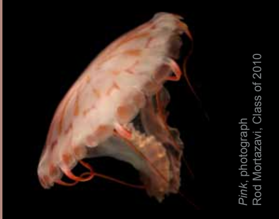
Pink , photograph Rod Mortazavi, Class of 2010