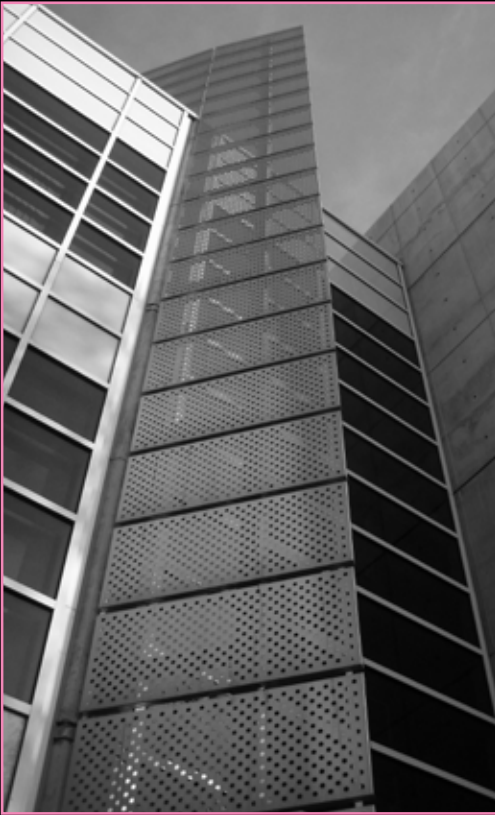
Shanbrom Hall 55 , photograph