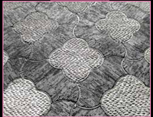
Order , photograph