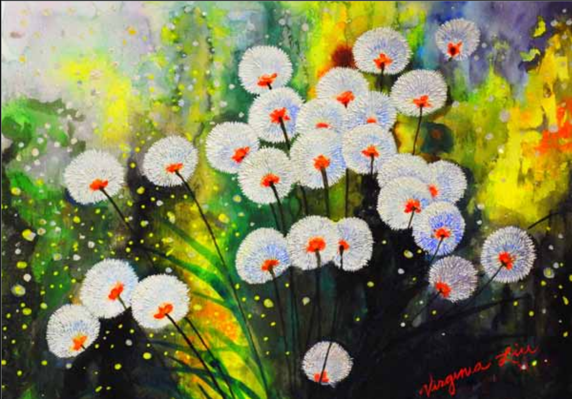
Wishes, watercolor Virginia Liu, Class of 2012