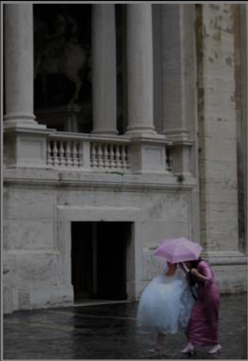
Pamela Swan, Class of 2010