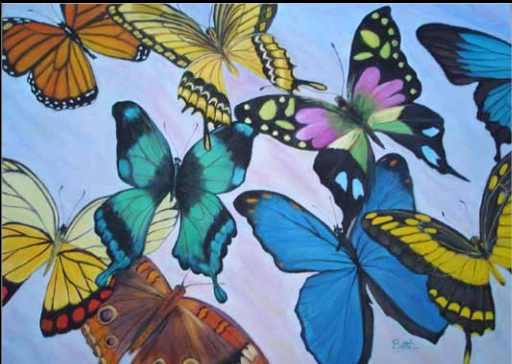
Flight, oil on canvas