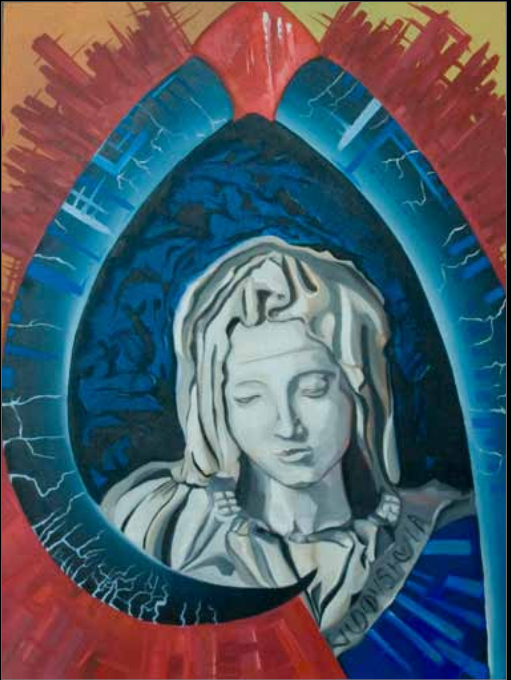
Asheen Rama, Class of 2012