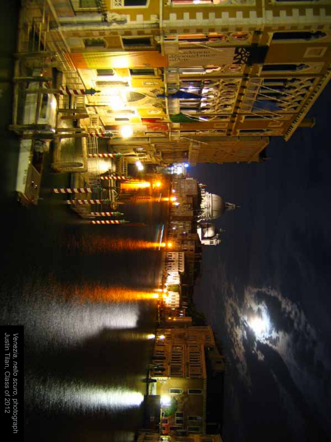
Venezia, nello scuro, photograph Justin Tlian, Class of 2012