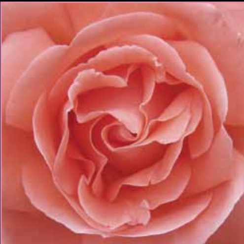
Burnt Pink , photograph