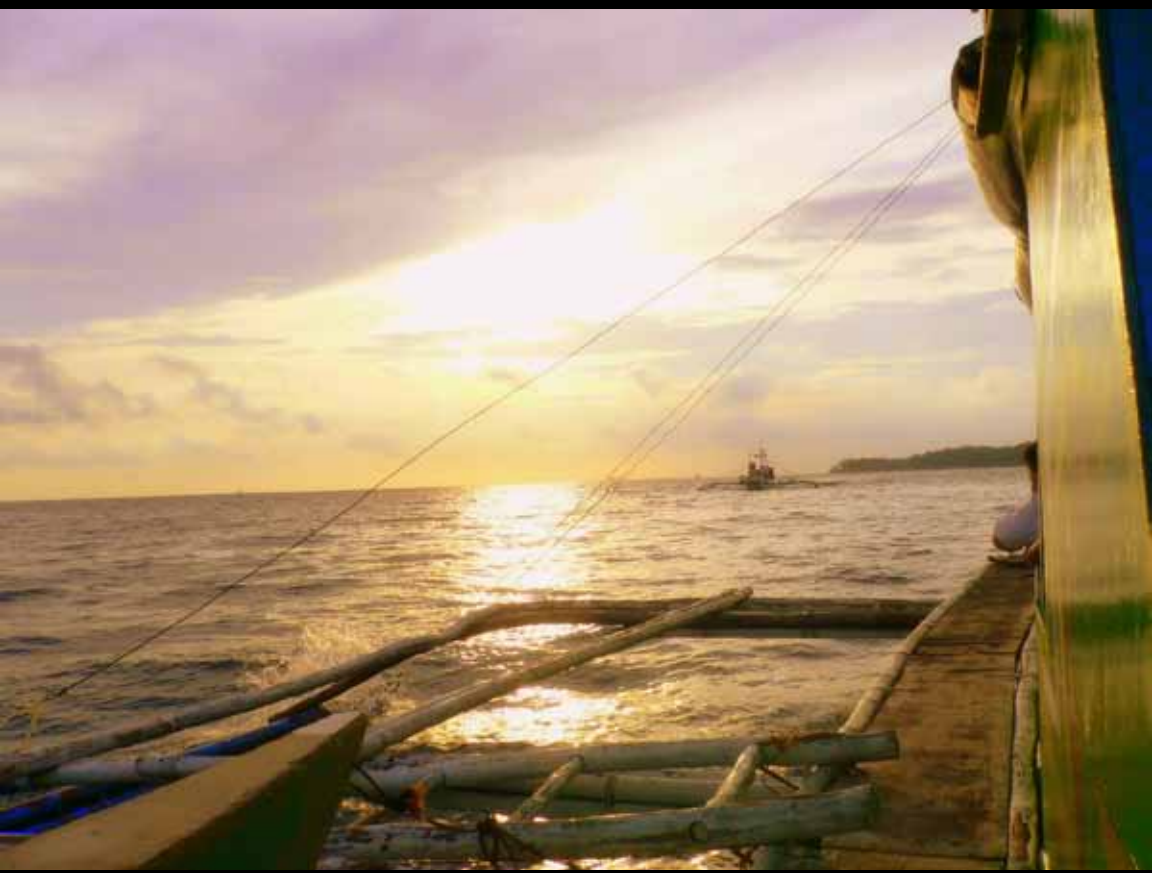
Last Boat to Paradise , photograph Justin Tilan, Class of 2012