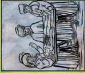
Surgerië , gouache, watercolor, and digital Chase Warren, Class of 2012