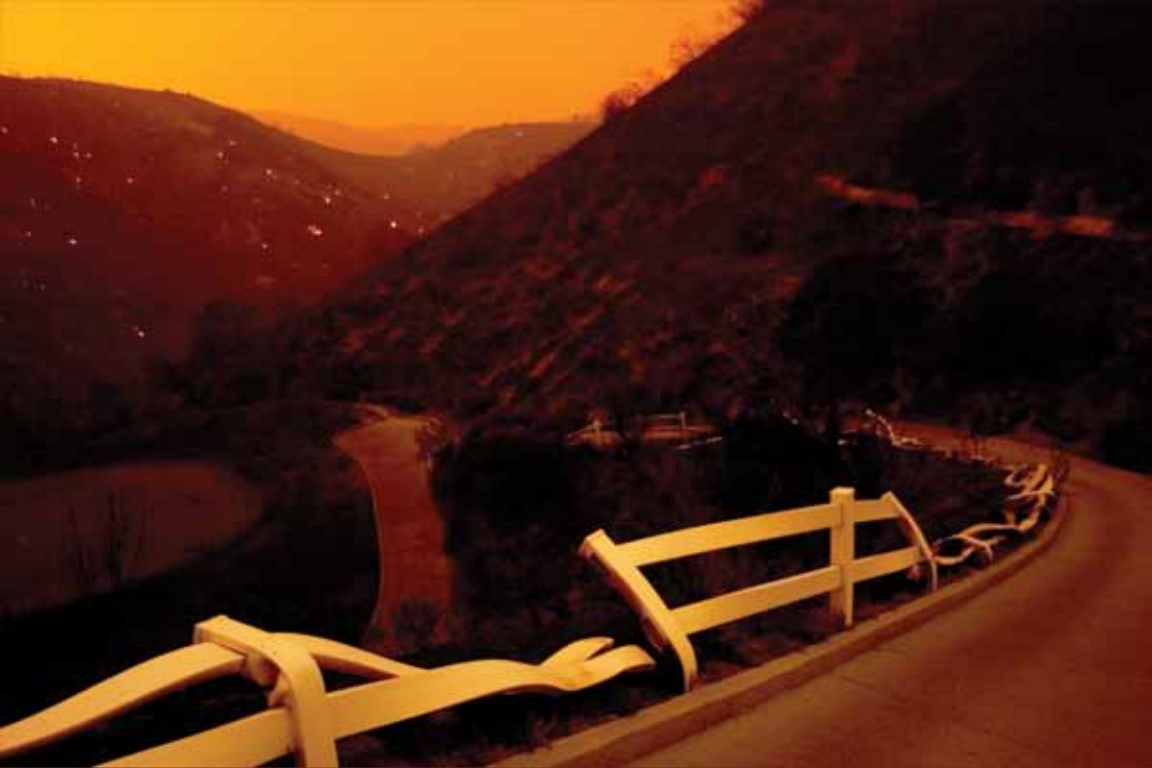
Feuer! (Black Gold Golf Course Burns) , photograph Reuben Paul, Class of 2010