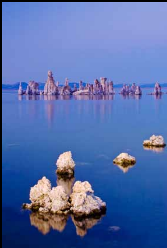
Mono Lake pastel sunset