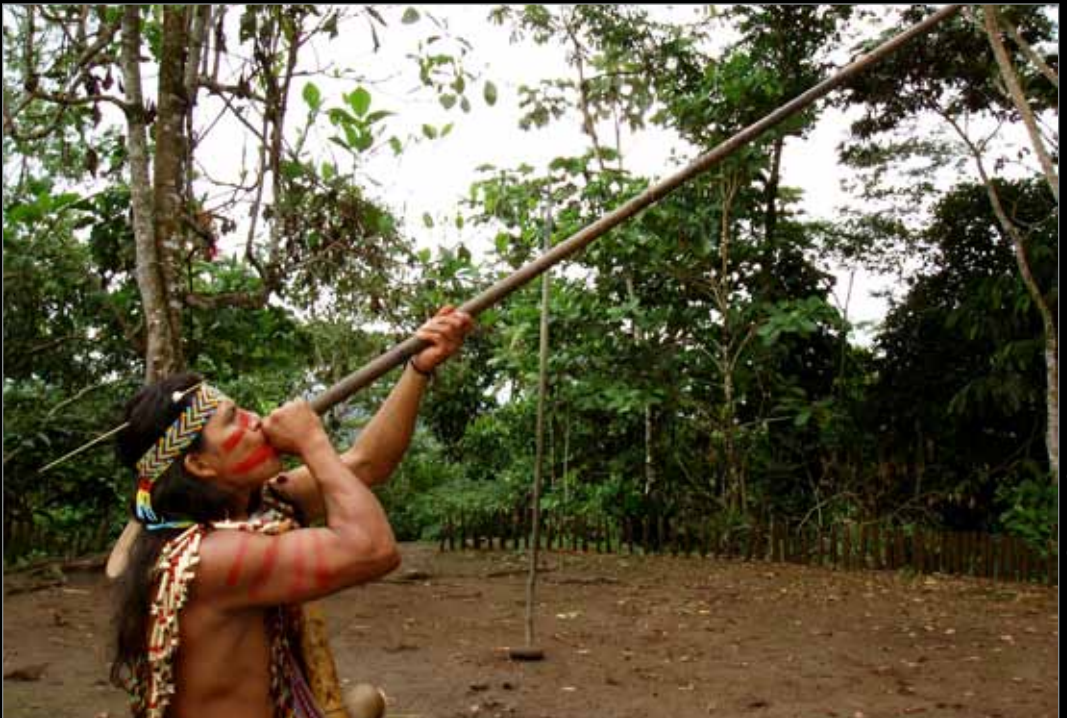
El Guerrero Shuar, Ecuador, photograph