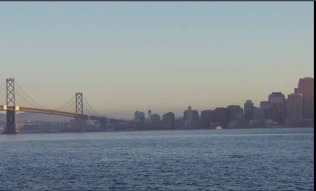
Panoramic Bay , photograph Kirellos Zamarly, Class of 2011