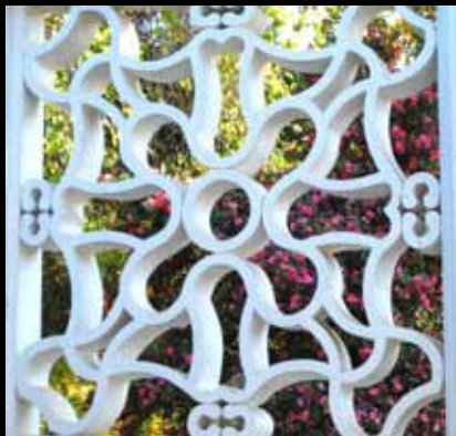
In Due Time , photograph Julie Hui, Class of 2010