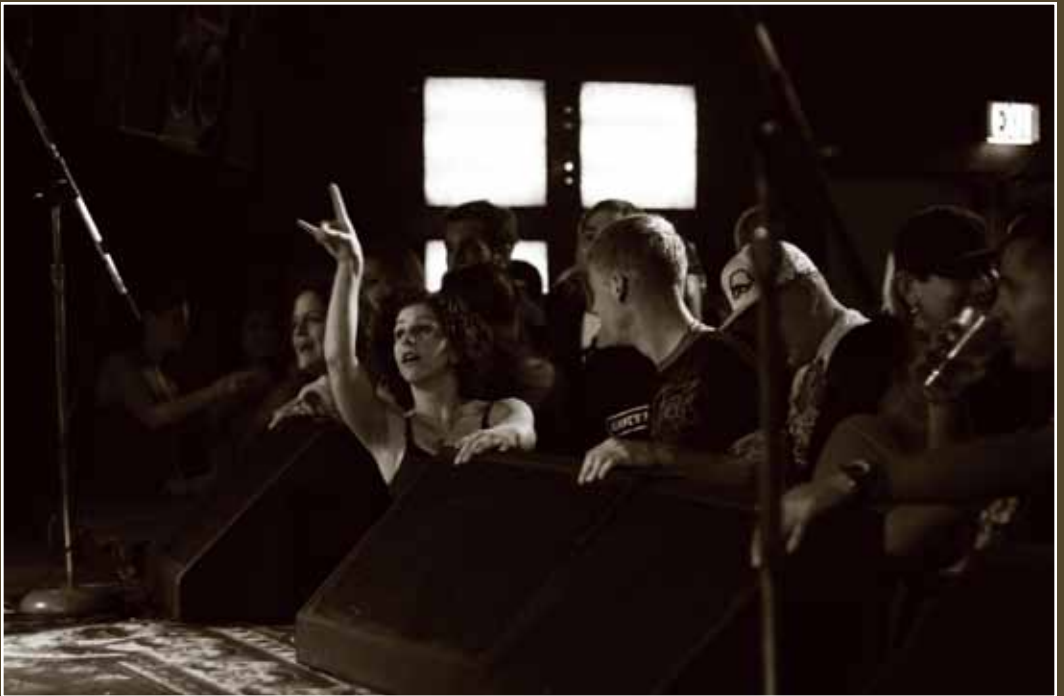
#1 Fan, photograph