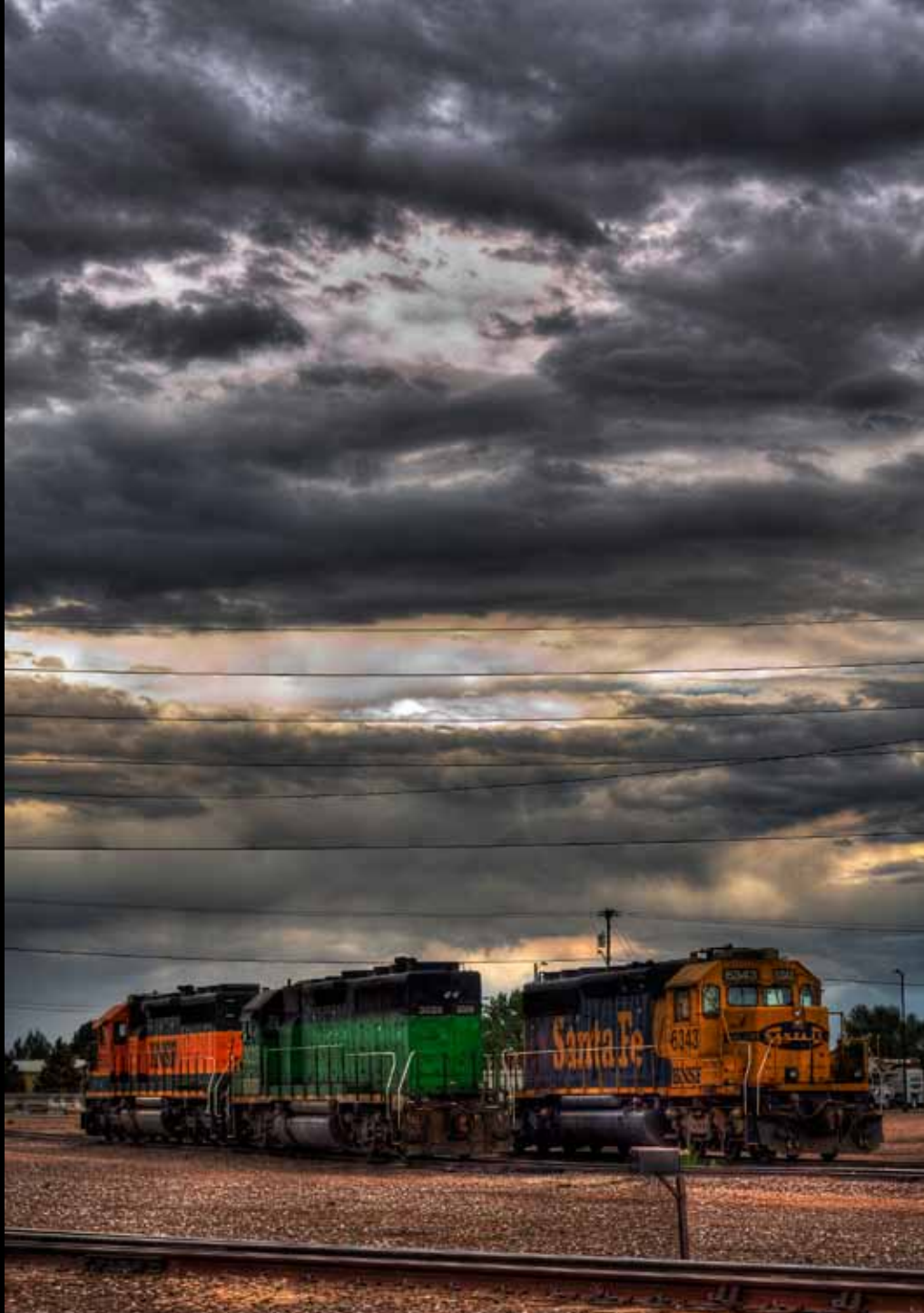
Jason Kang, Class of 2012 Train , photograph