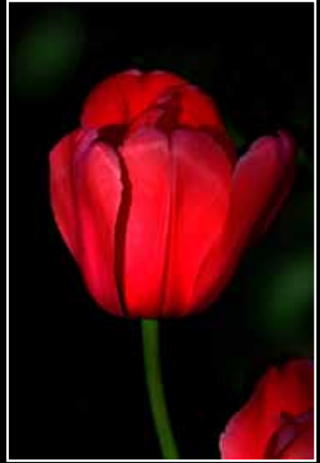
Passionate Color, photograph