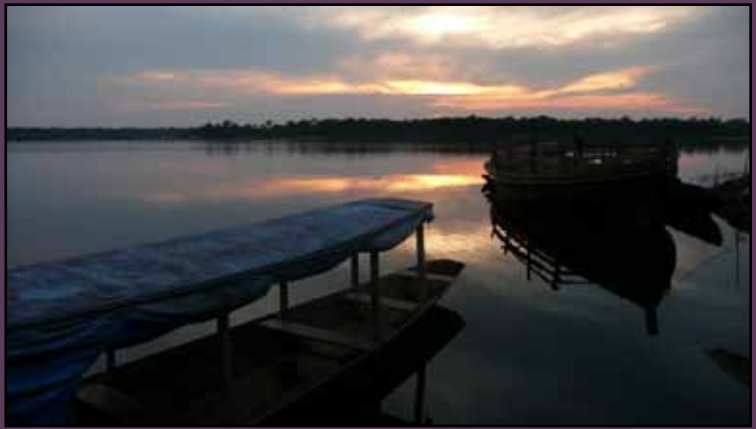
Shaun Chung, Class of 2010