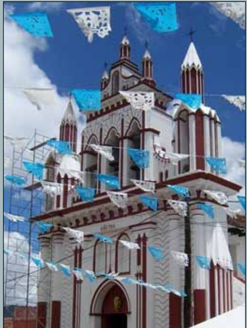
Catedral de los Mexicanos, photograph