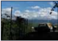
Escaping the Storm, Turks and Caicos , photograph