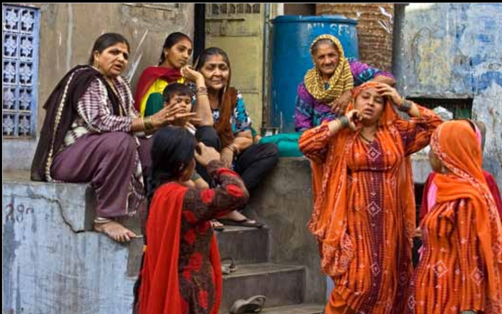
Social Hour in Jhodpur, photograph