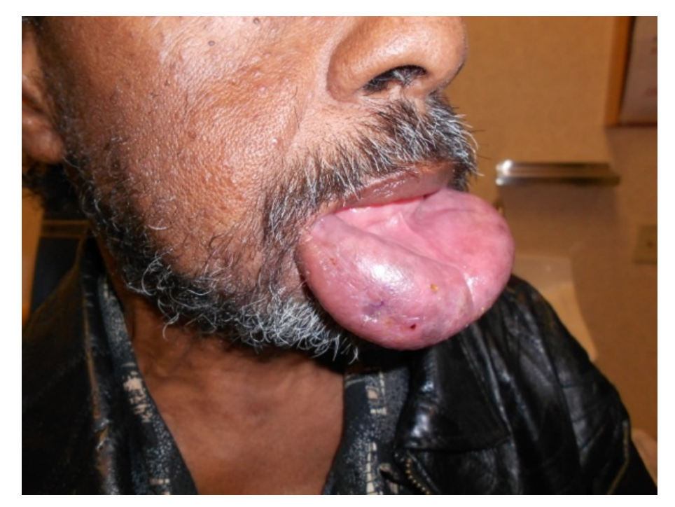
Figure 1. Granulomatous cheilitis in the lower lip