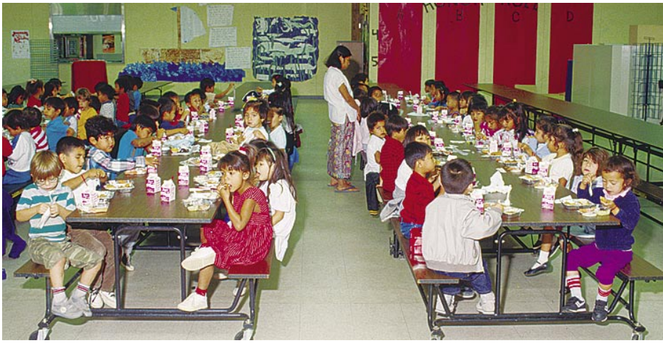
The Food Quality Protection Act reflects findings of a 1993 National Research Council report, Pesticides in the Diets of Infants and Children. The law requires an additional 10-fold safety factor on some pesticide tolerances to provide additional protection for young people.

less than 300,000 acres in production, which the EPA administrator determines do not provide sufficient economic incentive to support registration and for which there are no effective pesticide alternatives, or uses for which the available alternatives pose greater human risks. A pesticide can also receive minoruse status if it significantly aids in resistance management or improves IPM systems. The incentives may include an additional year of exclusive data use, waivers of certain data requirements and expeditious review that could bring the product to market sooner.