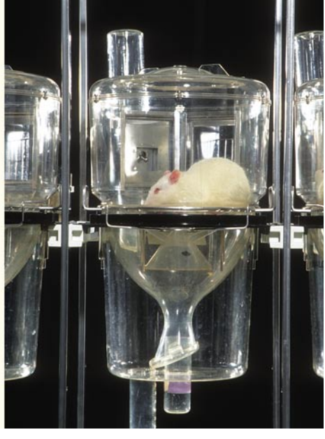
Toxicological research on animals helps to inform pesticide regulatory decisions.