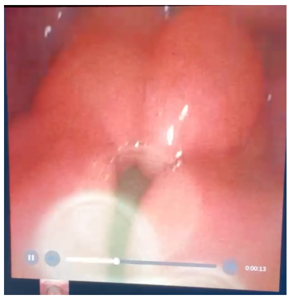
Video Laryngoscopy Link: https://youtu.be/C0CDbOWGCmE