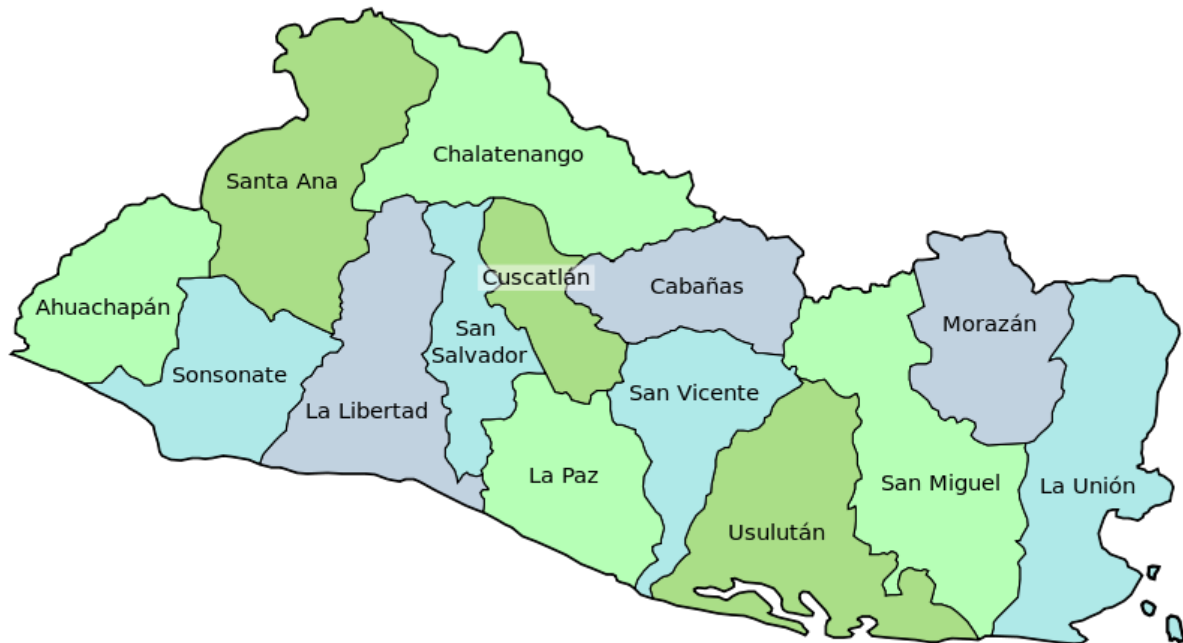
Figure 1. shows a map of El Salvador with the 14 departments. Ahuachapan (AHU), Cabanas (CB), Chalatenango (CHA), Cuscatlan (CUS), La Libertad (LL), La Paz (LP), La Union (LU), Morazan (MOR), San Miguel (SM), San Salvador (SS), San Vicente (SV), Santa Ana (SA), Sonsonate (SON) and Usulután (USU).

DNA samples were collected by the non-profit organization Pro-Busqueda from volunteers across the 14 departments of El Salvador in 2018. Volunteers were given a consent form and received instructions on how to collect their own DNA. Buccal samples were collected using Bode Buccal DNA Collectors (Bode Technology, Lorton, Virginia) and EasiCollect Plus buccal swabs (Qiagen, Hilden, Germany). After collection was complete samples were shipped to the Calloway Lab at the Children's Hospital Oakland Research Institute in Oakland, California. We received 726 samples from the Calloway lab with only sex and location information.