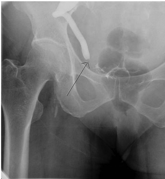
Figure 2: Aterograde nephrostogram demonstrating the obstruction at the ureterovesical junction.