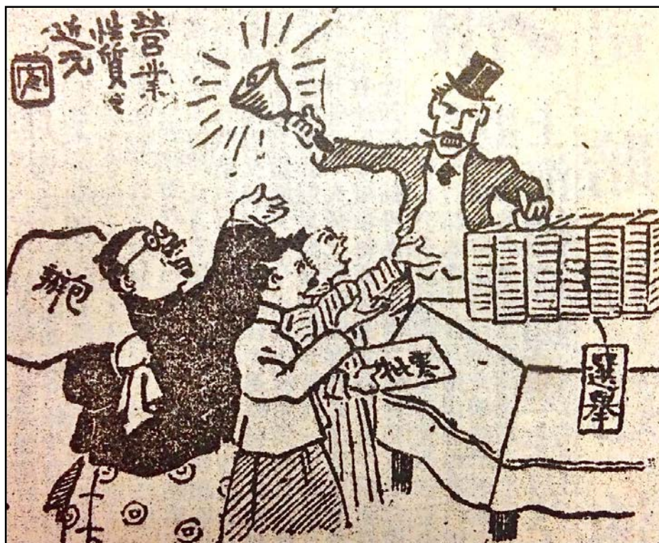
Figure 3. A political cartoon critical of election corruption. The stack of paper (perhaps ballots or polling station admission tickets) on the right is labeled "election" and is being sold to the two men on the left.

leadership roles in a number of political organizations in the mid and late 1920s. While it is possible that Yang came to Shen's attention through this lawsuit, it seems more likely that Yang filed his case only after securing approval from this influential civic leader.