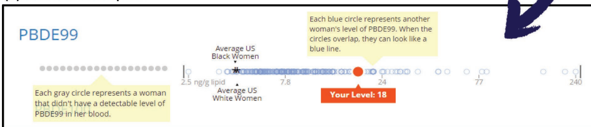
Figure 1. (A) During a typical user experience, participants first see their notable exposure results (headlines) on the Summary page. (B) Clicking on a chemical name takes them to more information about that chemical group, including exposure sources, health effects, options for taking action, and complete results. Chemical pages include personalized graphs that depict a participant’s chemical level in the context of the study distribution. (C) Digital features like explanatory pop-ups help people interpret the information-rich plots. (D) Participants can find more tips for reducing their exposure in the “What You Can Do” section. Other sections of the report include “Health Concerns” and “Overall Study Results” (not shown). To view an example web-based Digital Exposure Report-Back Interface (DERBI) report, see http://silent.spring.org/research-area/digital-exposure-report-back-interface-derbi (Silent Spring Institute 2016).