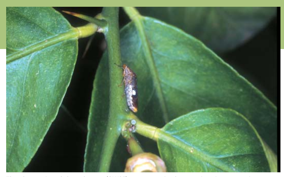
The glassy-winged sharpshooter (GWSS) was recognized as a serious insect pest in California in the mid-1990s. Subject to quarantine restrictions, nursery citrus is usually treated with insecticides to prevent the transport of GWSS throughout the state. Above, A GWSS adult rests on a citrus stem.

lassy-winged sharpshooter ∡ (GWSS), a nonnative insect, arrived in Southern California prior to 1990 (Sorenson and Gill 1996). However, it was not until the late 1990s that the serious nature of its potential as a vector of Xyllela fastidiosa, the bacterium that causes Pierce's disease in grapes, was recognized in California. From 1997 to 2000, the number of grapevines infected with Pierce's disease in Temecula, Calif., rapidly escalated from a small number to thousands (Blua et al. 1999). This epidemic pointed out to the grape industry the seriousness of GWSS as a vector of Pierce's disease.