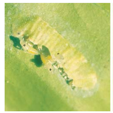
GWSS nymphs as they emerge from the egg case.