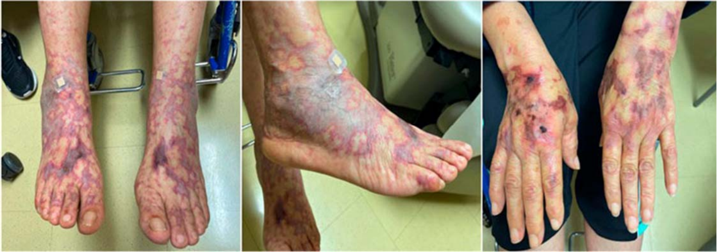
Figure 1. Reticular patches on the dorsal hands and feet at initial presentation.

On histopathology, livedoid vasculopathy is characterized by thickened or hyalinized superficial dermal blood vessels along with fibrin deposits. Perivascular hemorrhage and focal thrombosis are often seen [3]. In our case, the absence of vasculitis and vasculopathy on biopsy may have been due to the older age of sampled lesions. An elliptical biopsy was not performed due to the patient's significant skin fragility, which would have made skin closure challenging. Since the patient's symptoms showed no improvement on high-dose corticosteroids suggesting a non-inflammatory etiology, she was started on systemic anti-coagulation with subsequent skin healing. Though livedoid vasculopathy is a rare disorder for which there are no definitive therapeutic guidelines, anticoagulants,