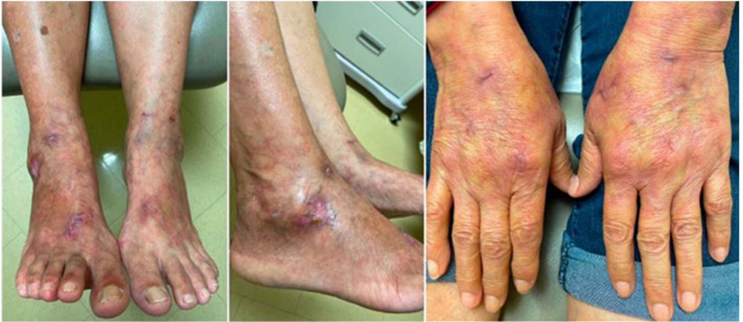
Figure 3. Resolution of reticular patches and ulcer healing after two months on rivaroxaban.

patients demonstrated improvement on rivaroxaban [10]. Further studies to investigate the pathophysiology of livedoid vasculopathy and the efficacy of rivaroxaban should be conducted to confirm these results.