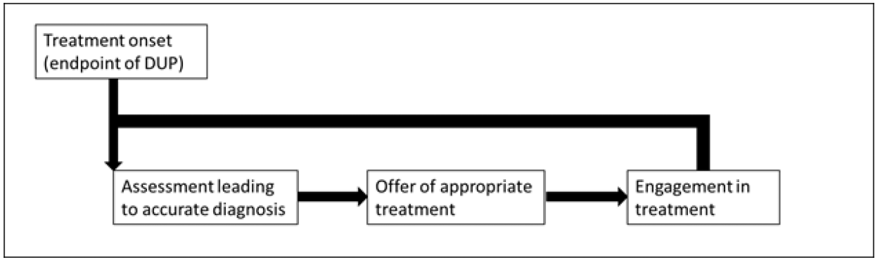
Figure 2. Process in Determining the Endpoint of Duration of Untreated Psychosis. Key: DUP: Duration of Untreated Psychosis.