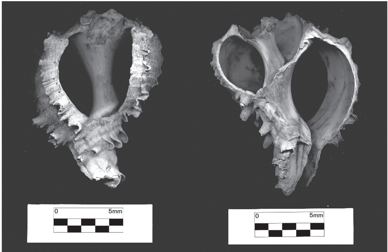
Figure 5. Hexaplex nigritus with evidence of meat extraction.

markers is needed to confidently show that sustained interaction occurred between the Baja Californian and the mainland Sonoran groups. At this point, the evidence suggests that the Kiliwa Indians and the earlier occupants at the El Faro site did not interact with groups across the Gulf on the western coast of mainland Mexico, once again hinting at the isolation of the Baja California settlers in the upper Gulf region.