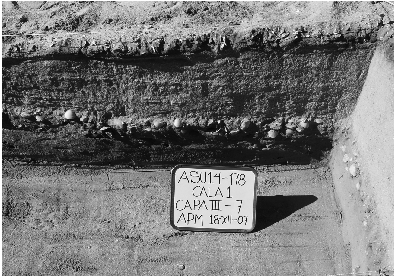
Figure 3. Trench 1 at the El Faro excavation.