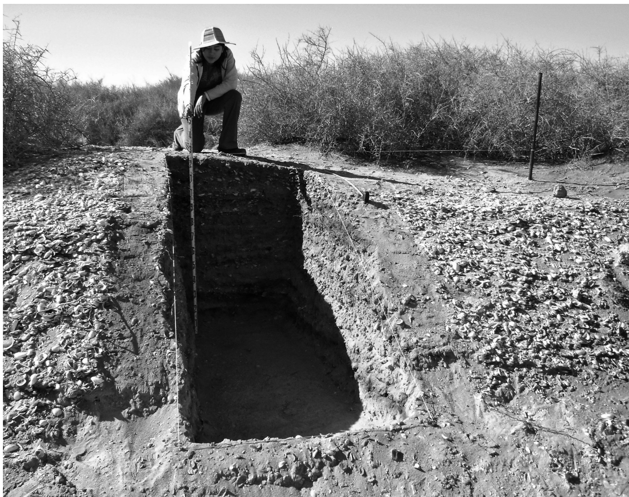
Figure 4. Trench 2 at the El Faro excavation.

obsidian, jasper, quartz, granite, and felsite. In the lower levels, the artifactual materials diminished substantially, with the exception of some small flaked andesite pieces.