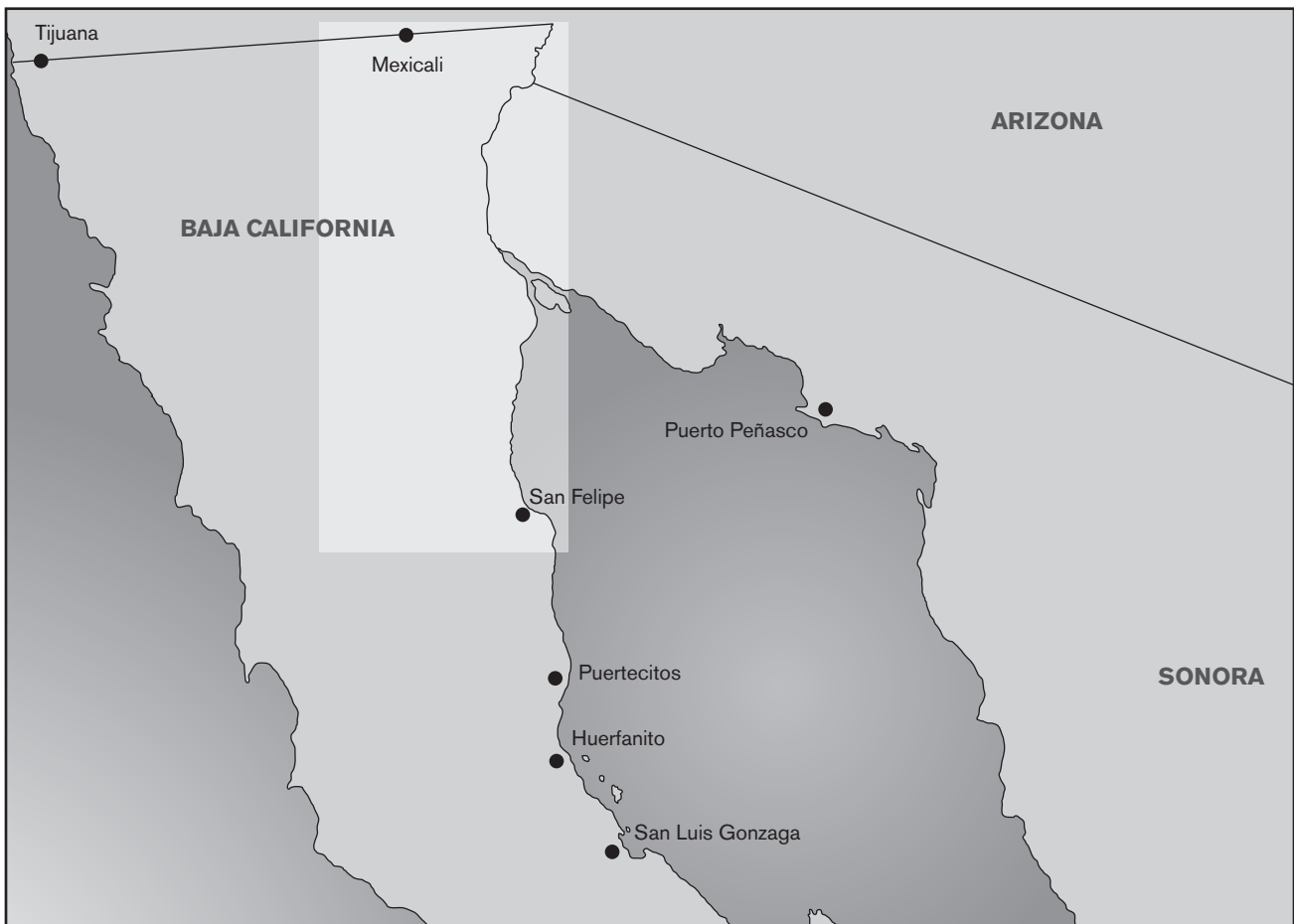
Figure 1. General research region.