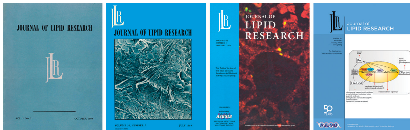
Fig. 2. JLR covers through the years. From left to right: First issue: Vol. 1, No. 1, Oct. 1959; Vol. 30, No. 7, Jul. 1989; Vol. 46, No. 1, Jan. 2005; and the first issue of our new cover honoring JLR 's 50th year, Vol. 50, No. 1, Jan. 2009.

backing,” and ever since the Journal “has been totally self-supporting” (1).