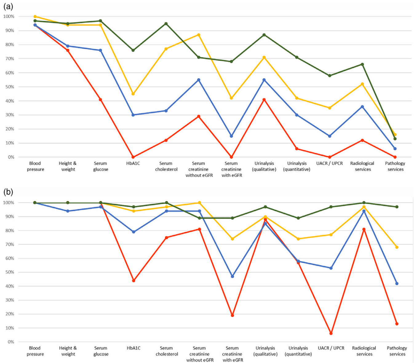
Fig. 1 Health-care services for the identification and management of chronic kidney disease by country income level. (a) Primary care (i.e. basic health facilities at community levels (e.g. clinics, dispensaries and small local hospitals)). (b) Secondary/specialty care (i.e. health facilities at a level higher than primary care (e.g. clinics, hospitals and academic centres)). eGFR, estimated glomerular filtration rate; HbA1C, glycated haemoglobin; UACR, urine albumin-to-creatinine ratio; UPCR, urine protein-to-creatinine ratio. Data obtained from Bello et al. 4 and Htay et al. 42 (—●—) Low-income, (—●—) lower-middle income, (—●—) upper-middle income and (—●—) high-income countries.

respectively. In comparison, acute peritoneal dialysis had the lowest availability across all countries. More than 90% of upper-middle-income and high-income countries reported having kidney transplant services, with more than 85% of these countries reporting both living and deceased donors as the organ source. As expected, low-income countries had the lowest availability of kidney transplant services, with only 12% reporting availability and live donors as the only source.