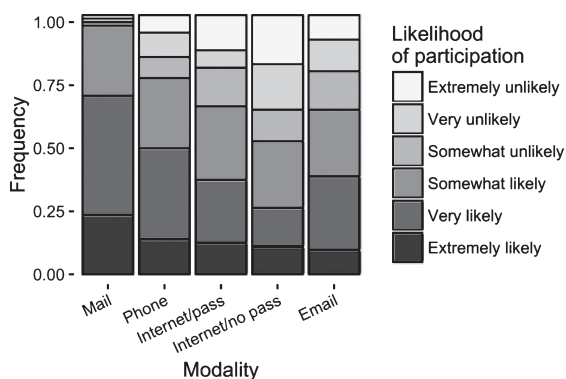
Fig. 1. Respondent willingness to enroll in registry modalities. The frequency of participant responses related to the willingness to enroll for each of five potential participant registry operation modalities is displayed. Modalities include mail, telephone (phone), Internet without password requirement (Internet/no pass), Internet with a password requirement (Internet/pass), and email.

Seventy-eight percent of respondents (CI: 0.67, 0.87) stated that they were very or extremely likely to enroll in a registry. When we asked about specific registry operations, 69% (CI: 0.58, 0.80) of respondents were likely to enroll in a registry by mail (Fig. 1). The proportions of respondents who were likely to enroll were reduced for the remaining modalities of registries (49% (CI: 0.37, 0.60) for telephone, 38% for email (CI: 0.27, 0.49), 37% for Internet (CI: 0.26, 0.48), 26% (CI: 0.16, 0.36) for Internet requiring