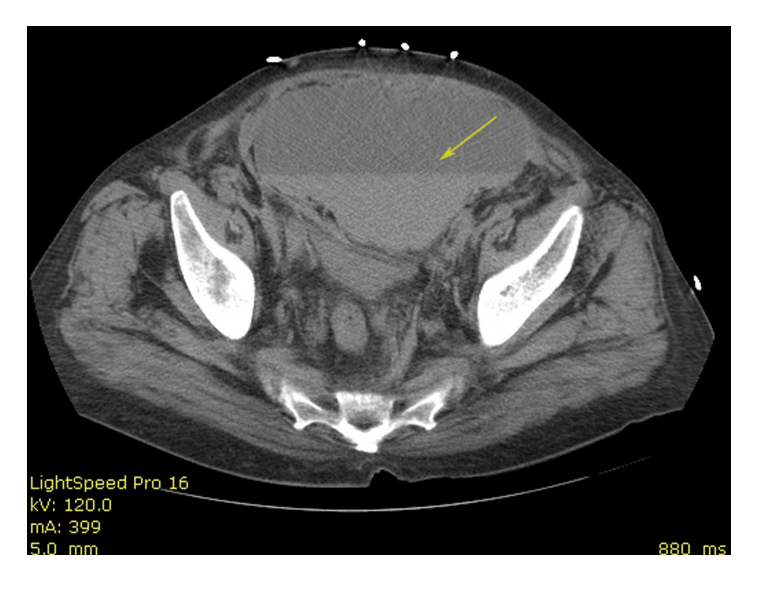
Figure 3: Noncontrast CT scan image of pelvis. Arrows denote complex fluid collection with layering consistent with hematoma.

tendinous posterior sheath wall in this area. Here, the rectus abdominis muscle is supported only by the transversalis fascia and the parietal peritoneum. Extension into pelvic cavity may not be noticed leading to frequent underestimation of the blood loss.