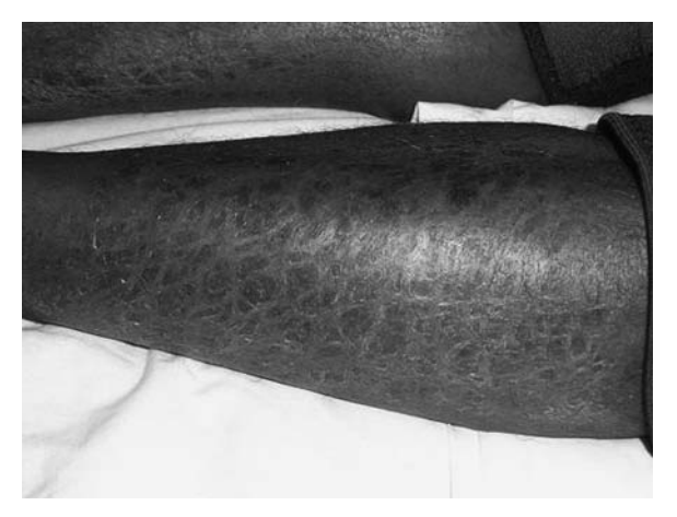
FIGURE 1. Hyperpigmented, scaly plaques spread diffusely across the bilateral lower extremities representing an ichthyosiform sarcoidosis.

pernio and ichthyosis of the lower extremities). He was started on corticosteroids (prednisone 1 mg/kg orally), as well as \beta 2 -agonist metered-dose inhaler and trimethoprim/sulfamethoxazole prophylaxis while immunosuppressed on prednisone. His testicular discomfort and dyspnea significantly improved with the initiation of above treatments, and he was discharged home with close follow-up to monitor symptoms and for titration of steroids.