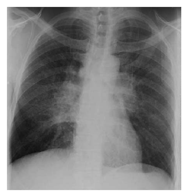
FIGURE 3. Frontal chest radiograph shows bilateral hilar fullness and perihilar micronodular opacities.

progressive disease, worse long-term prognosis, and higher rates of relapse. They also have an increased incidence of extrathoracic sarcoidosis, including lupus pernio and involvement of the reproductive system. Genitourinary sarcoidosis occurs 10 times more frequently in this population (Table 1).<sup>5,12,13</sup>