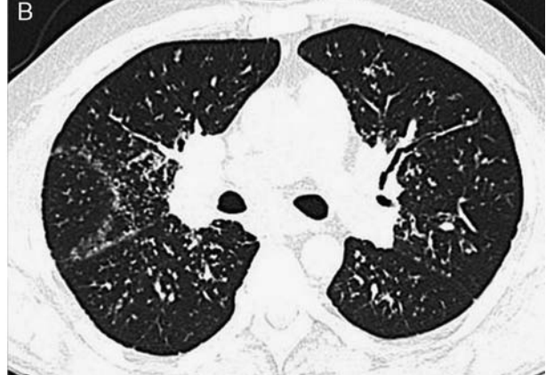
FIGURE 4. Axial thoracic computed tomography showing extensive hilar and mediastinal lymphadenopathy (A) and extensive pulmonary micronodules with a perilymphatic distrution (B).