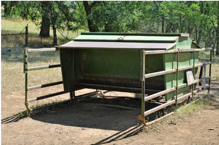
Modified creep feeder used to deliver mineral supplement to study steers. The setup protected the mineral mix from wind and rain to reduce waste and ensure accurate measurements of consumption.

The study procedures were approved by the Institutional Animal Care and Use Committee at the University of California, Davis (protocol #21524). Cattle were housed at the Sierra Foothill Research and Extension Center in Browns Valley, California. In each of three consecutive years starting in 2019, 148 British breed crossbred steers were stratified by body weight and randomly assigned to one of four groups of 37 steers receiving a self-fed custom mineral supplement (A. L. Gilbert Co., Oakdale, Calif.) with either no monensin (Control), 50 mg (Low), 125 mg (Medium), or 200 mg (High) monensin and 2.86 mg selenium if consumed