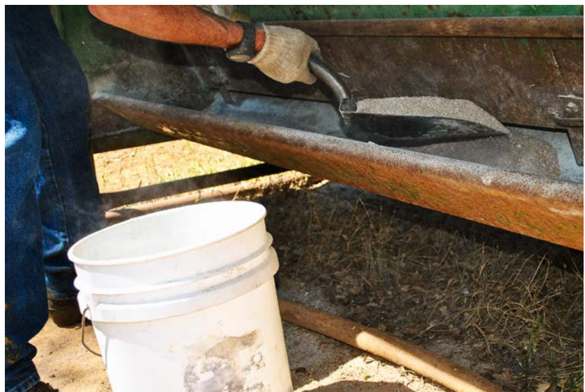
Leftover mineral supplement collected at pasture rotation to determine consumption during the period. The researchers found that higher doses of monensin result in less consumption of a mineral mix by stocker steers.

Steers were weighed the day before study start and their weights stratified into four quartiles. Within each quartile, the order of group assignments was determined through a random number generator within Excel (Microsoft, Redmond, Wash.) so that each of the four treatment groups was composed of approximately equal numbers of steers from each weight quartile. After being held off feed and water overnight (photo 1), the BW of individual steers was measured on five occasions approximately 40 days apart as follows: day 0; between day 36 and day 42; between day 71 and day 82; between day 106 and day 117; and between day 146