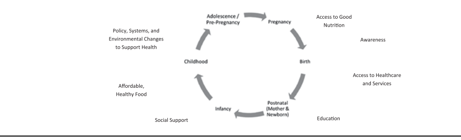
FIGURE 1. Continuum of care.

For years the standard of care regarding nutrition counseling for a woman of childbearing age was to intervene when the woman became pregnant. At the first OB visit (which is often at least 6 wk gestation), often the woman is told how much weight should be gained throughout the