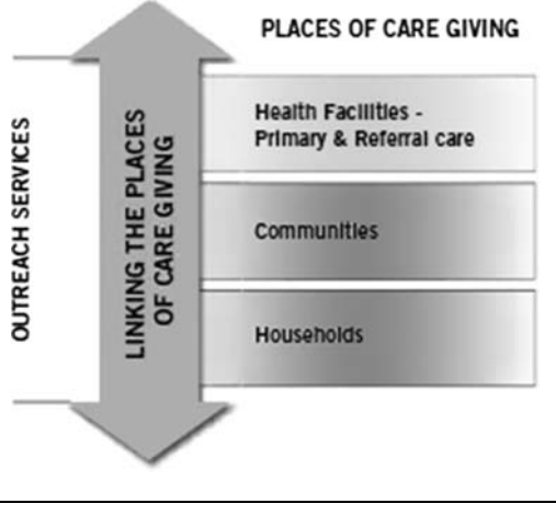
FIGURE 2. Continuum of care (place).

pregnancy. However, little guidance is provided by the practitioner to the pregnant woman regarding specific caloric and food intake. With our current obesity epidemic and the aforementioned cycle of obesity between mother and child, the call to action is to start these nutrition and health behavior interventions in the preconception period.<sup>7</sup>