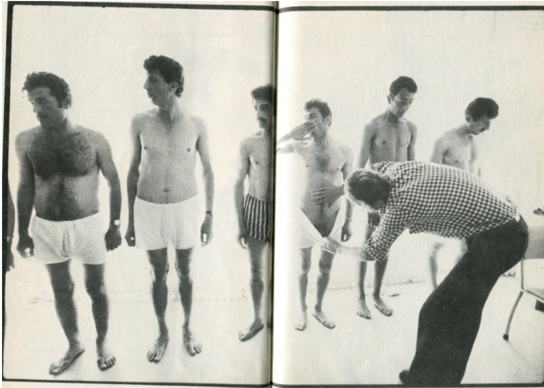
Fig 2. “Medical Examination, Istanbul” (Berger 48-49).