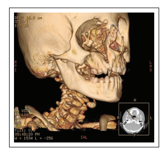
Figure 2. 3D reconstruction demonstrating extent of the orbitofacial cleft on the right. A similar appearance was noted on the left (not shown). Cleft begins between the lateral incisor and the canine and extends to the inferior orbital rim medial to the infraorbital foramen.

She was also noted to have right inferior conjunctivalcutaneous adhesions, proptotic globes, and bilateral scleral thinning (Figure 1). Imaging studies demonstrated bilateral clefting extending from the palate through the inferior orbit without inferior prolapse of the orbital contents. The visual axis, including both globes, the optic nerves, chiasm, and visual pathways, were unremarkable and suggested normal visual potential (Figure 2).