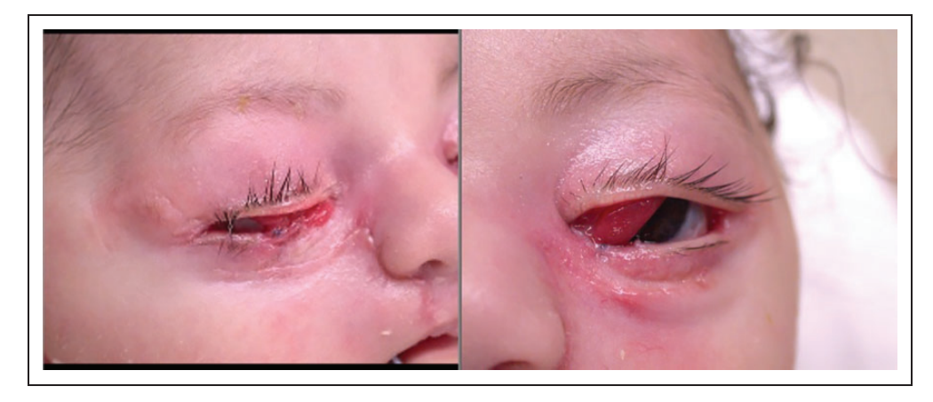
Figure 4. Postoperative appearance I week after Hughes tarsoconjunctival flaps and nasolabial transposition flaps.

examination, with manageable corneal exposure, and can fix and follow with each eye. A more comprehensive assessment of visual function cannot be performed given comorbid epilepsy, cerebral palsy, global developmental delay, and profound sensorineural hearing loss.