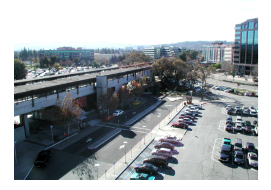
FIGURE 1 Current site conditions, Pleasant Hill BART station.

The EasyConnect field operational test was launched in August 2005 to introduce shared-use electric bicycles, non-motorized bicycles, and Segway HTs (known as the "low-speed modes") at the Pleasant Hill BART station. See Figure 1 below for a photograph of the existing Pleasant Hill BART station. The field test is designed to appeal to those who would like to take BART to commute to work, but are stymied by the inevitable "last-mile" problem.