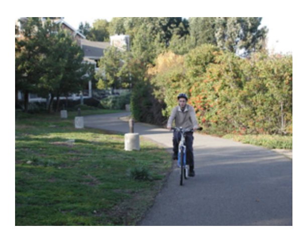
FIGURE 2 Bicycle rider in Pleasant Hill.

There is an extensive paved trail network in the Pleasant Hill BART area. The East Bay Parks District has granted permission to the research project to use the Iron Horse and Canal trails for "non-motorized" trails for the purpose of this program. Access to the trails greatly enhances the BART, employment, and shopping connections. See Figure 2 of rider on a bicycle trail in Pleasant Hill.