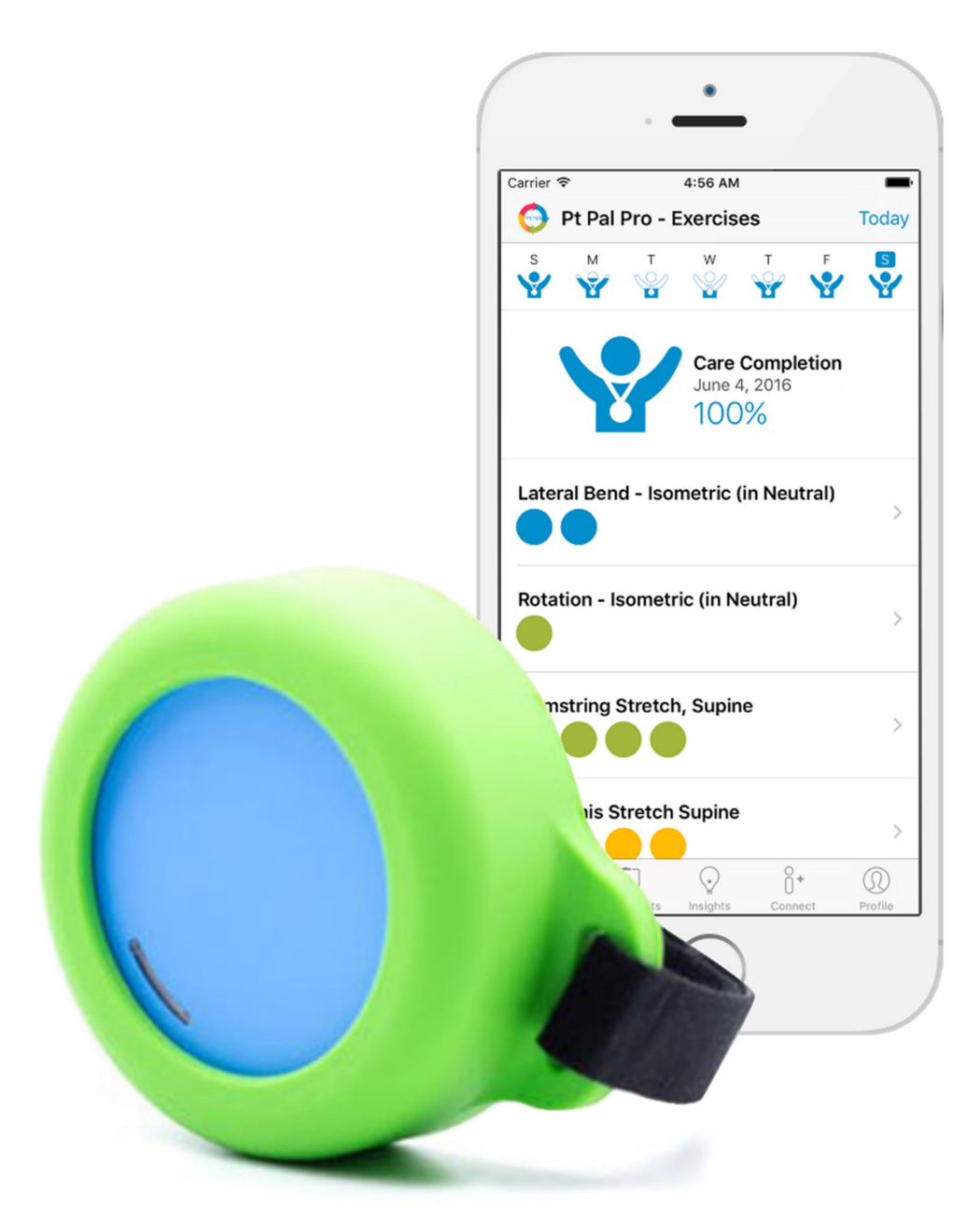
Figure 1. FitMi sensorized puck (blue) and silicone–Velcro strap (green) and Pt Pal patient app. The puck can be held and moved, squeezed, placed on a table or the floor and pressed, or strapped to a limb.