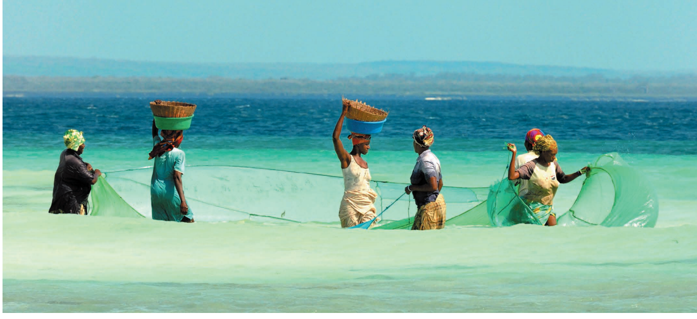
Women from a traditional sea-harvesting community fishing in Mozambique.

REPRODUCIBILITY A call to shun predatory journals p.326