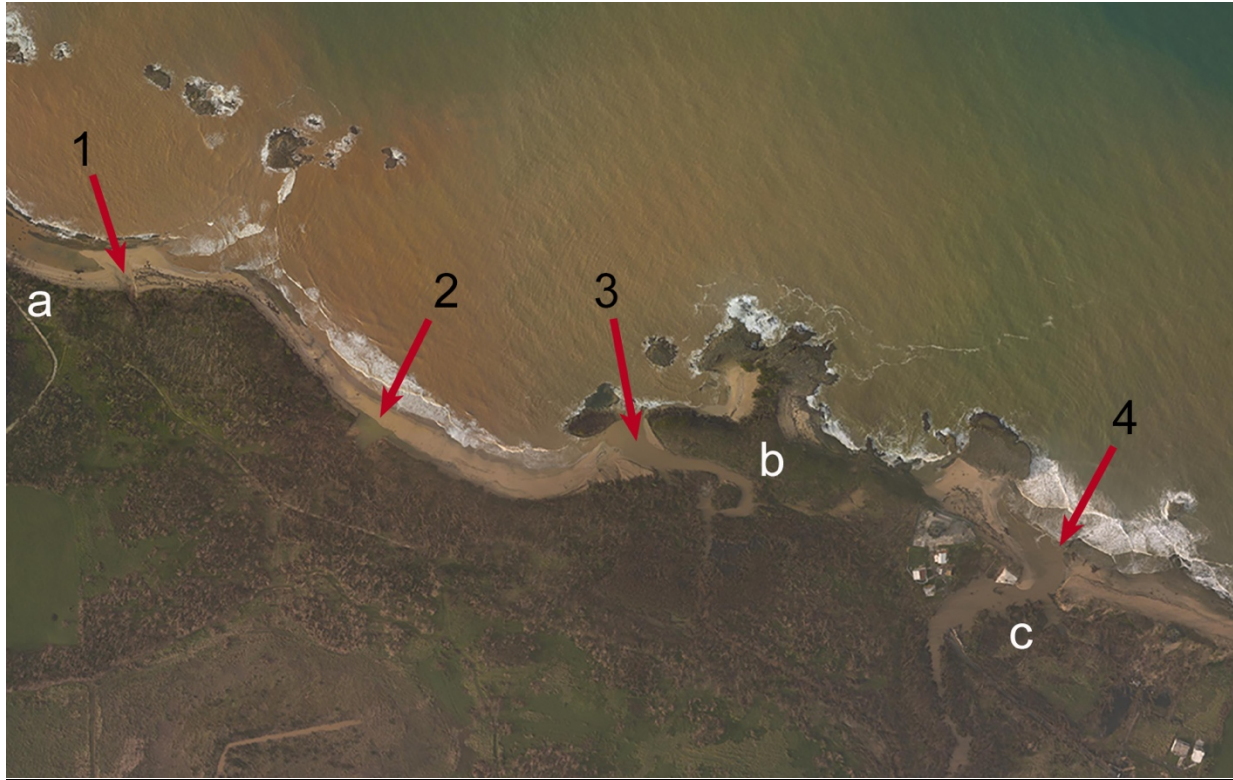
Figure 3: Impact of Hurricane Maria to the coastline. The red arrows mark the points where the coastal flooding breached the local sand dunes. Details are cross referenced in the text. The letters mark the location of archaeological contexts: a) marks the area of the possible new submerged site and the rock shelter near it, b) is Cueva Golondrinas and Playa de las Mujeres, and c) is the area of Sitio Botones (see text for explanations). The background photos are oblique and nadir imagery that was acquired following Hurricane Maria in September 2017. The aerial photography missions were conducted by the NOAA Remote Sensing Division. The images were acquired from an altitude of 2500 to 5000 feet, using a Trimble Digital Sensor System (DSS). The original zip files and imagery is available at https://storms.ngs.noaa.gov/storms/maria/index.html#7/18.056/-64.824 .

before, even after a systematic surface survey in 2014, and regular beach walk-overs since 2011.