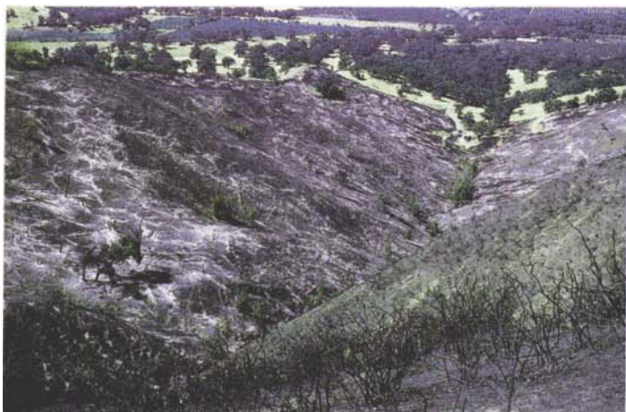
Between the late 1950s and early 1980s, watershed research at HREC focused on the impacts oak woodland-to-grassland conversion on water quantity, slope stability and erosion.