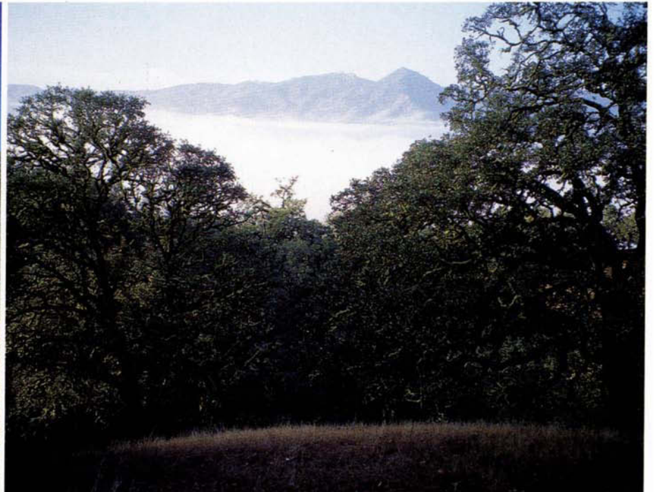
In the late 1990s, scientists launched a new series of studies on seven experimental watersheds at Hopland. Chaparral, left, is the dominant vegetation type on higher elevation (1,600 to 2,000 feet) watersheds, while oak woodlands, right, are typical at the lower elevations (500 to 1,000 feet).

next water year, resulting in greater water yields.