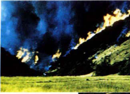
Watershed-scale research was initiated at the UC Hopland Research and Extension Center in the late 1950s. Vegetation on experimental Watershed II was cleared between 1960 and 1965, then burned.