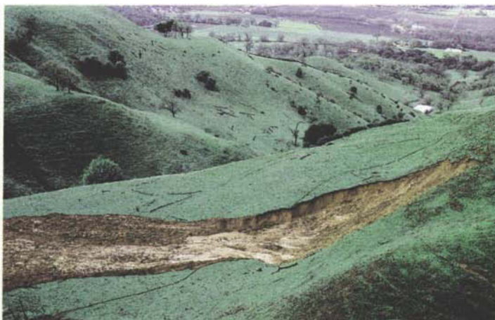
Watershed II was cleared in 1965, left; 20 years later, a large soil slip occurred following February rains, right.

municipal drinking-water quality, and costly wildfires due, in part, to unmanaged vegetation.