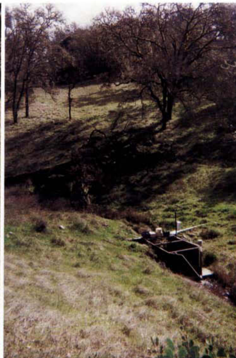
Stream flow and water-quality sampling equipment are located at the outlet of each experimental watershed. In coming years, studies will focus on the roles that grazing and fire management play in plant communities, hydrology and water quality.

events in the Russian River watershed. The data from Watersheds I and II further suggest that agricultural production practices in this region should maintain soil surface cover to enhance water infiltration and reduce surface runoff. Low ground cover leads to increased annual water yields, and especially increased summer/fall base flows. These can have benefits for anadromous fish species and the health and integrity of the aquatic ecosystem. Similarly, the conversion of ephemeral to perennial streams in upland watersheds will improve wildlife habitat by providing a summer source of water. However, these stream flow-related benefits came with associated, and significant, erosion problems.