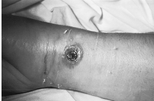
Fig. 1. Anthrax skin lesion.

present with abdominal pain, fever, and diarrhea that progresses to a sepsis syndrome with high mortality.