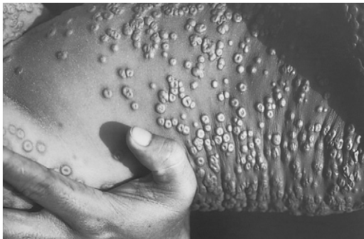
Fig. 2. Smallpox skin lesions on the trunk.

The diagnosis of smallpox can be confirmed with electron microscopy or gel diffusion on vesicular scrapings, but these modalities are not available in most hospital laboratories. If smallpox is suspected, the laboratory must be notified to take proper precautions. Smallpox specimens should be handled under biosafety level 4 conditions. Because testing for varicella virus is usually available, a vesicular eruption in which varicella cannot be identified should alert clinicians to possible smallpox. Specimens could then be forwarded for testing at a specialized laboratory, such as at the CDC or U.S.