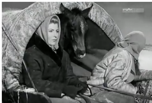
Figure 9: Still from Wolfgang Schleif's Preis der Nationen (1956)

Significant in this regard is the absence of a scene found in Lützkendorf's screenplay in which the horse trek crosses paths with a refugee trek and camp. The horse trek provokes astonishment and disbelief in the adults ("nur Pferde?" ["just horses?"]) [6]) and rapture in the children. In light of the rest of the film, this scene serves to underscore that the horses are symbolic