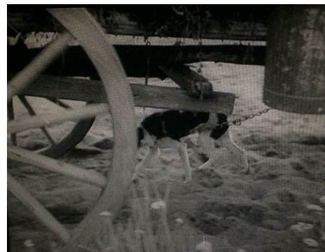
Figure 16: Still from Milo Harbich's Freies Land (1946)

While the pre-existing footage and reenacted scenes of flight all mimic, in some form, the Nazi newsreel footage, Free Land conveys a vastly different interpretation of the 1944/45 flight from the Red Army. The film does not explicitly draw attention to the nature of the source of the newsreel images. Instead, Harbich employs the same tactic as the newsreel (the voiceover) to shape the way that viewers interpret and understand the images that they see. In sum, Free Land begins with an impersonal sequence of flight—extreme long shots explained to us by the well-known commentator Harry Giese, who provides broad explanations for who these people are, from where