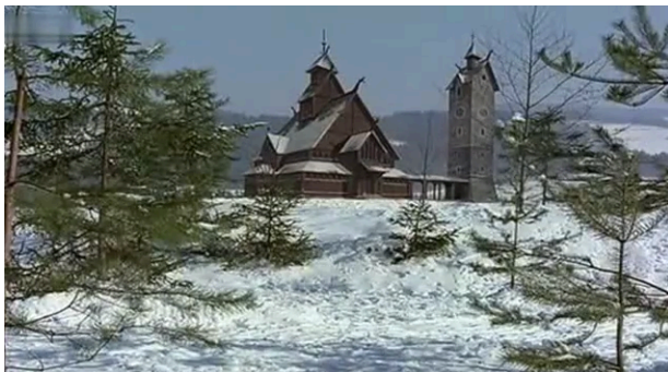
Figure 5: Still of the church in Silesia in Wolfgang Liebeneiner's Waldwinter (1956)