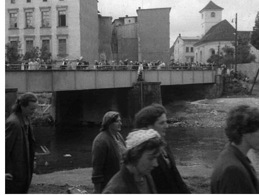
Figure 29: Repatriates enter Zielno (II)