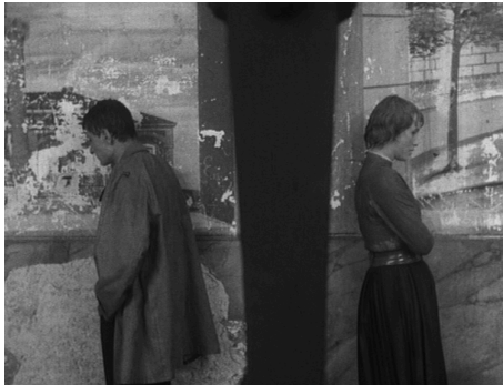
Figure 32: Still from Kazimierz Kutz's Nikt nie wola (1960)