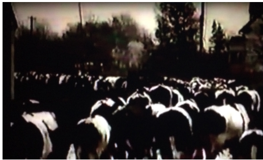
Figure 18: Still from Deutsche Wochenschau 754

historical chaos caused by a delayed evacuation of the populace, as was the case in Königsberg and Breslau; rather, it is chaos born of hubris and selfishness on the part of the ruling class. The Count and Countess do not strive to take their peasants with them, but rather to run with as much as they can carry—or drive stampeding across the border.