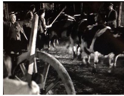
Figure 19: Still from Kurt Maetzig's Schlösser und Katen (1957)

As far as the historic event of flight from the Red Army and the presence of resettlers are concerned, the film centers both squarely within the confines of the SBZ and the GDR. Here, flight is a sign of guilt, of an allegiance to the upper classes and to the Nazis. Though this flight also takes place in 1945, it is not the flight from the lost East, but rather, from the perspective of the 1957 viewer, Republikflucht . The resettlers who choose to remain in Holzendorf, therefore, are the “good” resettlers. Because they do not flee from the Soviet occupiers, they are, according to the logic of the film, guiltless victims. Their potential for agitation is stilled with land reform—how could they clamor for their homes in the East when, despite all difficulties, they have land right here? This narrative runs counter not only to the reality of private and clandestinely organized refugee/expellee sentiment in the GDR, but also to the SED’s own position on the so-called “resettlers,” which largely treated them with suspicion.