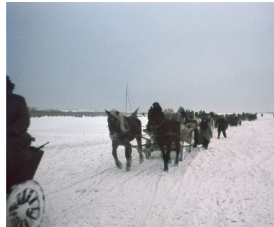
Figure 8: Vinzenz Engel: "Flüchtlingstreck zieht über das zugefrorene Frische Haff" (January/February 1945), Inv. En. © Copyright bpk / Vinzenz Engel.