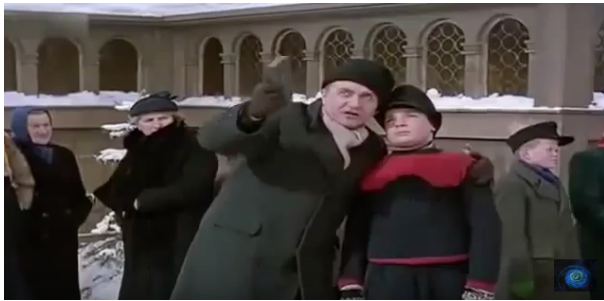
Figure 1: Still from Wolfgang Liebeneiner's Waldwinter (1956)

light of day, it brings unrest over the world. And the people must wander, from east to west and from north to south. Not only here at home, everywhere in the world”). This story of comfort becomes a sound bridge linking the initial image of dispersal and that of the actual refugee trek (see Figures 1 and 2 ). This sound bridge increases the viewer’s confusion, as it links the image of flight, which is supposed to begin the next morning, with the narrative present of crowd dispersal and storytelling.