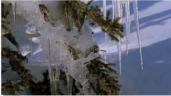
Figure 3: Still of initial frame of Wolfgang Liebeneiner's Waldwinter (1956)

think—that perhaps it will snow roses and rain wine. With this triumphal note, the sun sets over the landscape, the composition identical to that of the film’s opening shot, but for the setting sun (see Figure 4 ).