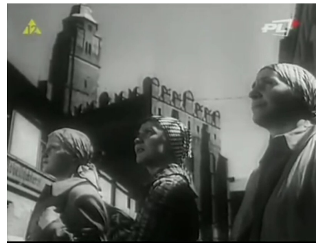
Figure 27: Still from Stanisław Różewicz's Trzy kobiety (1957)

The necessity of a “fresh start” constitutes one instance of what I identify as the film’s leitmotif of interruption. 256 In fact, the film begins in medias res , during the “interruption” (war,