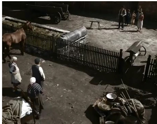
Figure 41: The Kargul and Pawlak families prepare to confront each other at the fence. Still from Sylwester Chęciński's Sami swoi (1967)

peace; together with their families, they tear down the physical symbol of the divisions between them. This peace, however, is short-lived. The revived war/feud takes on more serious dimensions that indicate the careful allegory at play: in order to de-mine their field, Pawlak and Paweł, the latter wearing a German Nazi helmet, set fire to the field, thereby detonating the mines (scorched earth). Their “ingenuity” sparks a chaotic exodus from the town, as everyone believes that the Germans have returned to reclaim their land. In contrast to the future of Poland’s western and even eastern borders, 304 the fence separating the Kargul and Paweł homesteads clearly demarcates the limits of each family’s sovereignty and property (see Figure 41 ).