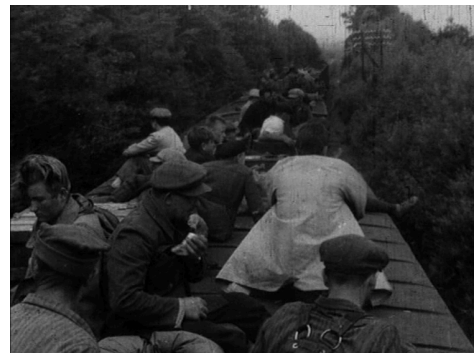
Figure 35: Still from Kazimierz Kutz's Nikt nie wola (1960)

The massive changes from novel to film indicate some of the cinematic silences with regard to the representation of expellees from the Kresy and of the experiences of concrete displaced peoples (Polish Jews in Uzbekistan, Polish-Ukrainian [if she is not simply from the Kresy ] women in the Recovered Territories, Poles from the Kresy , etc.) in the immediate postwar period. Specifically, the erasure of Bohdan/Bożek's Jewish identity intimates what The Law and the Fist will clearly confirm: that despite the significant presence of Jewish communities in the Recovered Territories (primarily in Lower Silesia) in the early postwar years, the representation of their