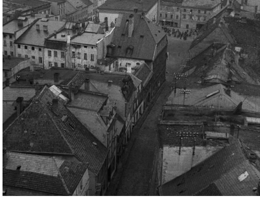
Figure 28: Repatriates enter Zielno (I)