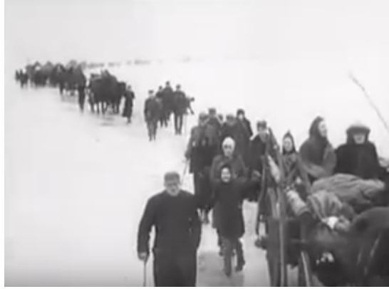
Figure 10: Still of archival footage embedded in Frank Wisbar's Nacht fiel über Gotenhafen (1959); original source: Deutsche Wochenschau 754 (16 March 1945)

If the all too exact reproduction of the imagined or artistically rendered referent creates slippage between the real and the reenacted (as in the case of the sinking scenes), the intertwining of archival footage with the represented chronotope of the road becomes, however paradoxically, an intrusion into the narrative. The scenes are familiar, they are “real,” and while they are supposed to situate the protagonists in a particular historical moment on a particular road (the refugee trek from East Prussia to Gotenhafen along the Vistula Lagoon), these images interrupt the melodramatic narrative. As much as they are intended to establish a context for the protagonists and support the film’s claims to authenticity—as if to say, with Francisco de Goya, “this is how it happened”— 166 they are non-diegetic, an intrusion from the outside. The refugee treks are fact, but the events recorded in these images—even if one can imagine Maria and Generalin von Reuss among these shuffling figures in a distorted black-and-white (see Figure 10 )—are not happening to the protagonists, the protagonists are not involved. For this reason, even though the hardships of flight over the frozen Vistula Lagoon, where ice was thin and prone to crack, the scenes of the ship’s sinking are more powerful, according to contemporary viewers. The “montage” of realistic,