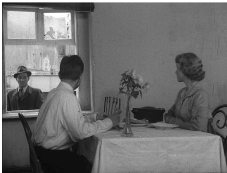
Figure 34: Still from Kazimierz Kutz's Nikt nie wola (1960)