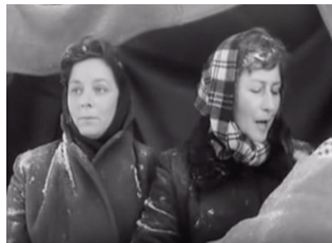
Figure 14: East Prussian woman singing during flight

We do not meet the Jewish cabinetmaker Wiśniewski on the road, but earlier in the film in Frau Kubelsky's apartment, where the SS have interrupted a soirée in order to arrest her and the man she has been hiding. When confronted by the SS-officer, Frau Kubelsky drapes her arms