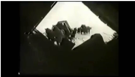
Figure 24: Still from Deutsche Wochenschau 754

Rakowen in the symbolic, synthetic image of Gertrud and the children resting, exhausted, among overturned and abandoned military vehicles on the side of the road. Unlike the other representations of flight, Ways Across the Land establishes a critical parallel between civilian refugee trek (Gertrud) and that of the Wehrmacht (as part of the history of the GDR).