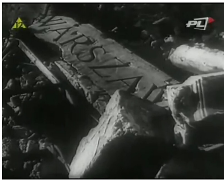
Figure 26: Still from Stanisław Różewicz's Trzy kobiety (1957)

on the door panels: “Jedziemy na Ziemie Odzyskane!” (“We are going to the Recovered Territories!”). While the women walk into town, the sun shines, the city is bright (see Figure 27 ). If the chunk of façade metonymically represents the destruction of the Polish state, of Warsaw, of the protagonist’s past lives, the ex-German town of Skołyszyn in the Recovered Territories, with its bright lighting, open, uncluttered compositions, and extreme-long shots, represents freedom, and a fresh start. 255