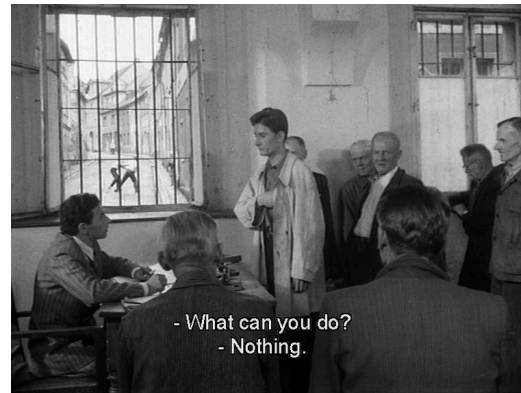
Figure 31: Street brawl in the background

The territory itself has also been reduced to psychological mirror or prop. While, as Andrzej Gwóźdź argues, the film contains “gestures” that expose the origins of the land and the uncertainty of the times, and which personalize the otherwise impersonal process of Polonization, the territory as setting is not formative. 273 The situation in the Recovered Territories does not