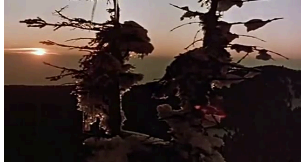
Figure 4: Still of final frame of Wolfgang Liebeneiner's Waldwinter (1956)