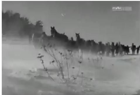
Figure 7: Still from Wolfgang Schleif's Preis der Nationen (1956)

occupies the center of the frame is again not human (not mother and daughter), but the colt between them (see Figure 9 ).