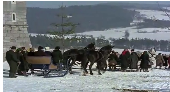
Figure 2: Still from Wolfgang Liebeneiner's Waldwinter (1956)

Rather than allow the audience to experience the trek with the townspeople, the camera shies away melancholically, sweeping down and toward the snow bank in the foreground. It rests upon this snow bank momentarily; a match cut, which one at first might mistake for a continuity error, or a jump cut, replaces the image of the first snow bank with that of a second snow bank, only distinguishable from the first because it is fresh and, in comparison to the cooler, bluish tones of the Silesian snow, is warmer and yellower in hue (complementary colors). In the instant that the film cuts to this snow bank, the camera returns from whence it came, tilting up the bank and zooming deep into the new setting. Through this cut, Forest in Winter shows and yet simultaneously elides the representation of the traumatic experience of flight.