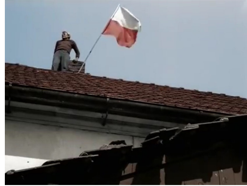
Figure 40: Paweł surveys the land from the roof of the house in the Recovered Territories. Stills from Sylwester Chęciński's Sami swoi (1967)

While the film overtly references neither the Polish-Soviet Ukrainian nor the Polish-East German border, the main conflict between the families is a matter of borders. Due to the fact that both families have left their homes due to the border changes in the east and that they settle in territories acquired as a result of thereof in the west, the issues of property and borders battled out between them can be read as an allegory for Poland's fraught relations with its own neighbors to the east and west. In the Recovered Territories, the Pawlak-Kargul feud even adopts the language and the trappings of war. Barely settled into their new homes, Pawlak and Kargul meet each other at the fence, uncertain whether to rejoice or to posture aggressively (see Figure 41 ). At Pawlak's request, the two remove their hats and engage in an awkwardly formal peace ceremony "na okoliczność, że nasza wędrówka ludowa już się zakończyła. I trzeba było wojny, żeby zdobyć pokój. A teraz płacz" ("On the occasion that our people's wandering has ended. And there had to be war in order to reach peace. And now, cry"). Pawlak and Kargul embrace, and as both families rush to embrace each other over the fence dividing their properties, they destroy the fence and topple over each other. 303 The two men, as the respective heads of their families, jointly declare