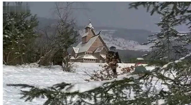
Figure 6: Still of the Silesian church reconstructed in Bavaria in Wolfgang Liebeneiner's Waldwinter (1956)

As even these initial and final shots indicate, there is tension between the film’s discourse (that of lost Heimat) and the visual argument (that they never left Heimat). As I have illustrated, the sequence preceding and including the flight of the townspeople links an image of crowd dispersal from the church to an image of flight originating from the same location—the old man’s story of universal migration and Heimatverlust bridges together the two shots. Through the visual