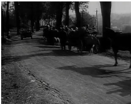
Figure 36: Kenig leaves Siwowo as the "repatriates" enter

repatriate train traveling toward the camera) (see Figure 37 ), so, too, does the end, with the repatriate trek ambling in one direction and the militia jeep rolling in the other. These mobile images suggest that the promise of stability in Siwowo is ambivalent, for even as the repatriates bear their livelihoods, and with them, the promise of a mix between ex-German and Polish life in a common cityscape, the film ends with movement. If stability is to be achieved in these territories, it may be, as the theme song soothes: “In a day, in two, in a night, in three, but not today.”