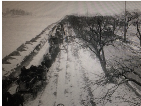
Figure 23: Refugee trek and retreat of the Wehrmacht. Still from Martin Eckermann's Wege übers Land (1968), Part III

and the history of the GDR, it also adds an element generally missing from the other representations of flight we have seen: the retreat of the Wehrmacht . 225