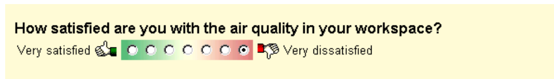
FIGURE 1. Sample occupant satisfaction question (screen shot of web-based survey)

The survey implementation process typically begins with an email informing building occupants of the survey web site address, start date and end date. This email is drafted and sent either by CBE or the sponsoring agency. Subjects can open the survey at their convenience. After linking to the survey, respondents see a welcome screen informing them of the purpose of the survey. The welcome page also advises them of the amount of time it should take to complete the survey, and their rights as a research participant. Participation in the survey is voluntary and anonymous. Upon starting the survey, participants click through a series of questions asking them to evaluate their "satisfaction" with different aspects of their work environment. Satisfaction is rated on a 7-point scale ranging from "very satisfied" to "very dissatisfied". In most cases, respondents who indicate dissatisfaction (the lowest three points on the scale) with a particular aspect of their work environment are branched to a follow-up screen probing them for more information about the nature of their dissatisfaction. Respondents who indicate neutrality or satisfaction (the upper four points on the scale) move directly to the next survey topic. When applicable, respondents are also asked to assess the impact of environmental factors on their effectiveness in getting their job done.