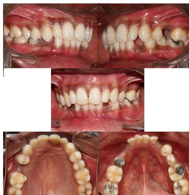
Fig. 2: Intraoral photographs

(b) Buccal-object rule - If the vertical angulation of the cone is changed by approximately 20 degrees in two successive periapical films, the buccal object will move in the direction opposite to the source of radiation. On the other hand, the lingual object will move in the same direction as the source of radiation. The basic principle of this technique deals with the