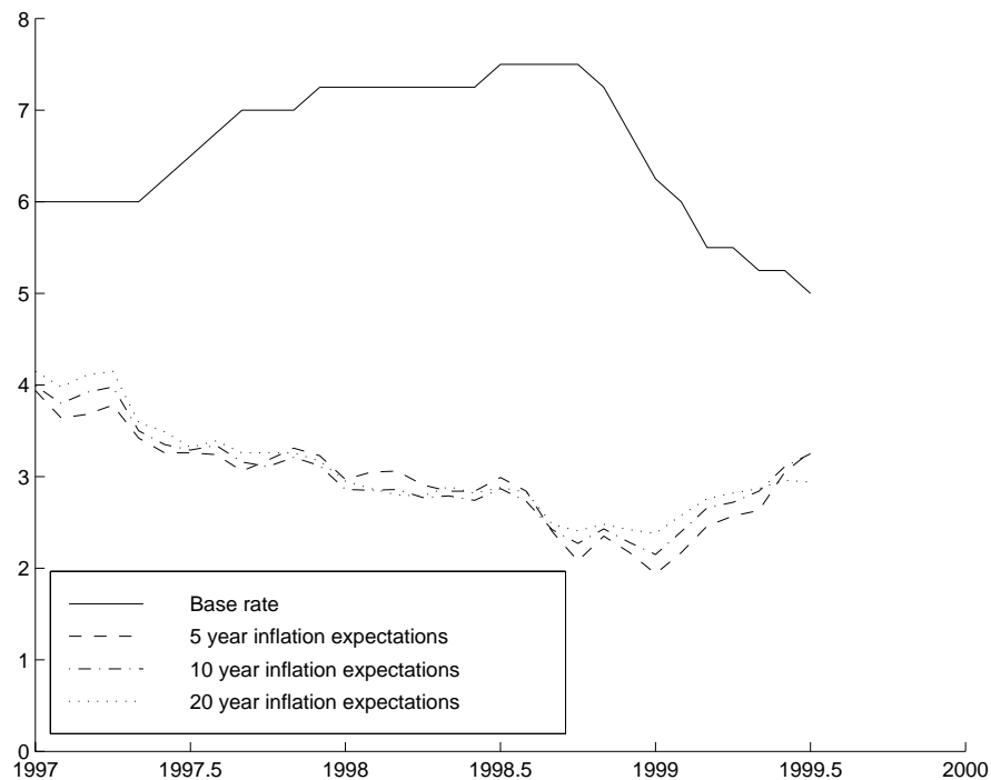
Figure 2: Market expectations of inflation and the base rate in the United Kingdom.

horizon, derived from prices of nominal and indexed government bonds (gilts). 22 The figure displays a striking, negative relationship. This is confirmed by more formal econometric analysis. Regressing market inflation expectations over a ten year horizon ( INFL\_EXP ) on a constant, the base rate ( BASE\_RATE ) and one period lagged inflation expectations gives