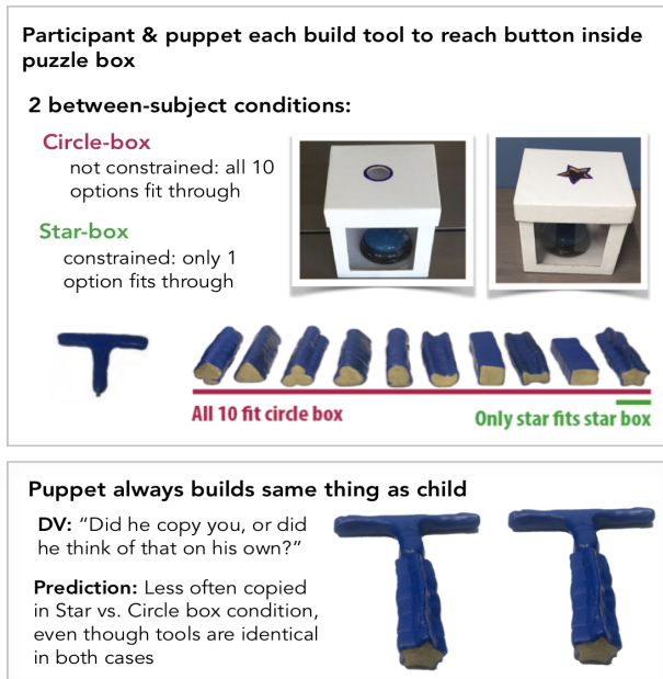
Figure 3: Exp. 2, Method. We manipulated functional constraints on the builders' designs and asked if children took these constraints into account when judging the likelihood of copying.