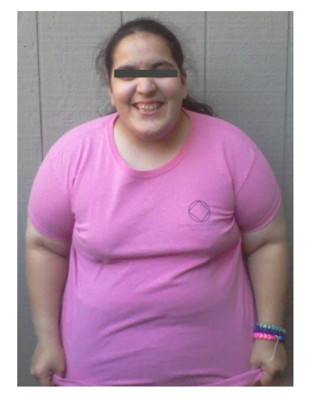
Figure 1. A female adolescent with FXS Prader-Willi-like phenotype.

The physical phenotype and dysmorphology of FXS include signs of a connective tissue disorder such as a long and narrow face, large and prominent ears, a high arched palate, hyperextensible finger joints, pectus excavatum, flat feet, soft skin and mitral valve prolapse. Other features include low muscle tone, and pubertal macroorchidism (31,32). Noteworthy approximately 30% of young children with FXS will not have obvious dysmorphic features; the physical features are associated with the FMRP deficits. The most evident effects of lower levels of FMRP in both males and females are prominent ears and hypermobility of the metacarpal-phalangeal (MP) joints (33,34). In males FMRP deficits are associated with a narrow face and large ears, while in females the FMRP deficits are associated with increased ear prominence and jaw length (35). In about 5-10% of children with FXS a Prader-Willi phenotype is observed including severe obesity, hyperphagia, hypogonadism and in some cases delayed puberty (36,37) (Figure 1). The reduced expression of the cytoplasmic interacting FMR1 protein