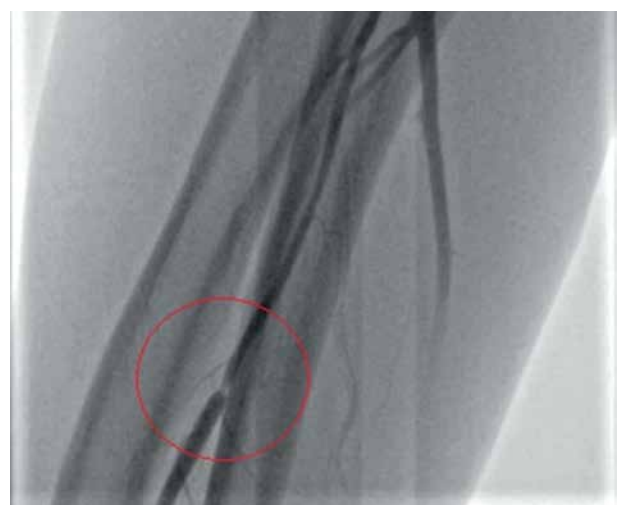
Figure 3. Focal narrowing at the tip of sheath increasing the risk of radial spasm

The median of arterial blood pressure measured in the radial artery at the beginning of the procedure was 151/71 (132/60; 180/80) mm Hg. The administration of a radial cocktail resulted in a decrease in systolic pressure by 30 mm Hg, diastolic pressure by 10 mm Hg and mean arterial pressure by 14 mm Hg (presented as medians). The occurrence of hypotension after radial cocktail