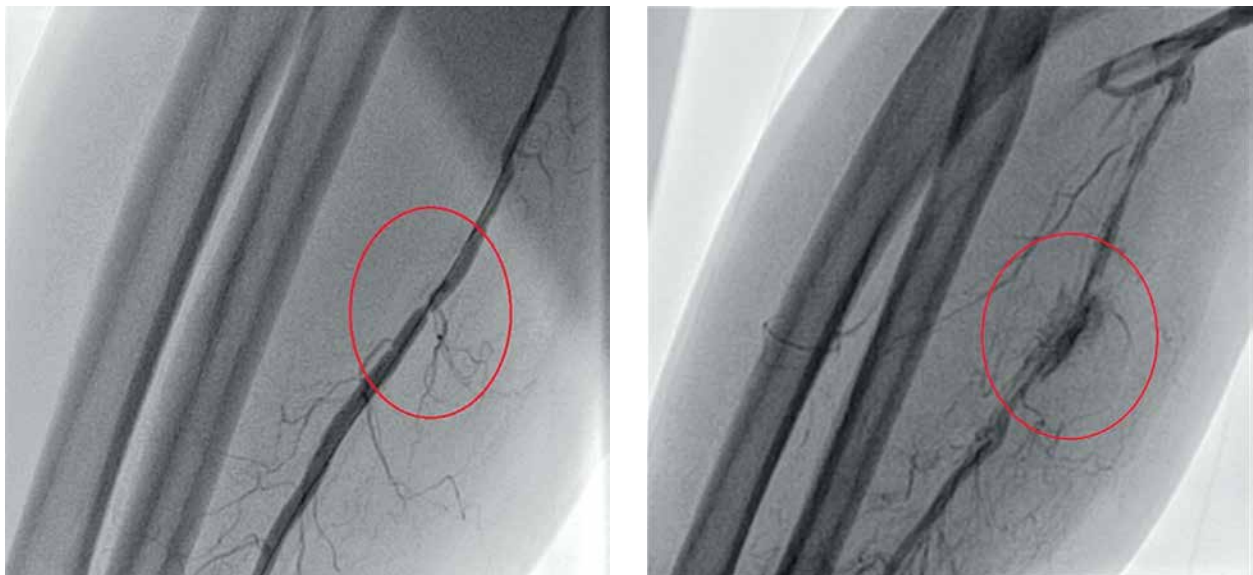
Figure 2. Narrow focal spasm predicting intraprocedural radial dissection

omatic spasm interrupting the procedure. It also was not a significant risk factor for spasm. The occurrence of spasmodic image at the end of the procedure was greater – 60.1%. Detailed results of artery dimension measurements are presented in Table III. As demonstrated in Figure 4, spasms in the radial artery had diverse morphology. Two main determined morphologies were focal or segmental. The location also varied – the spasm could be limited to a single part of the artery or involve the whole vessel. The incidence of different types is presented in Table III.