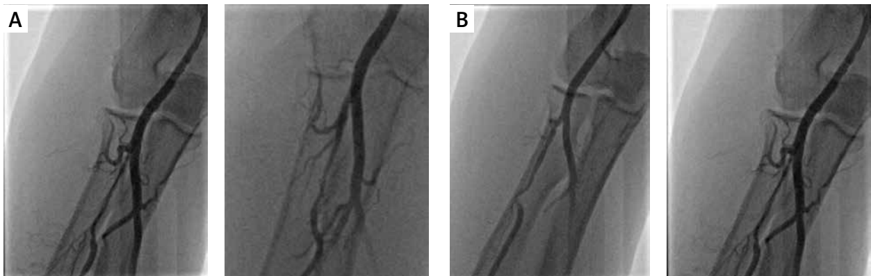
Figure 1. Spasms overcome by application of a coronary guidewire. A – Spasm crossed with Hi-Torque Balanced Heavyweight (Abbott Cardiovascular, Plymouth, MN, US) – angiography before and after the intervention. B – Spasm crossed with Hi-Torque Balanced Middleweight (Abbott Cardiovascular, Plymouth, MN, US) – angiography before and after the intervention