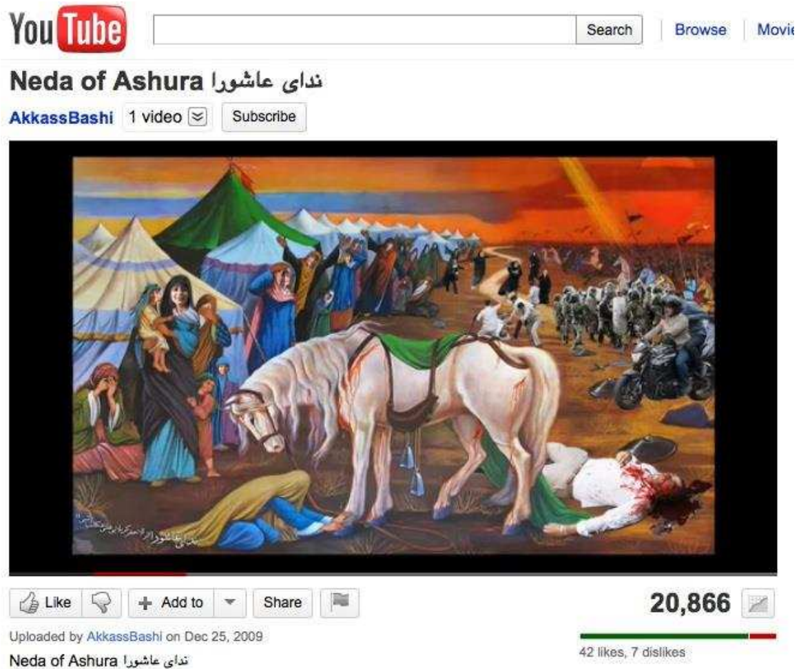
Figure 5. Screen shot of digital collage of Neda Agha Sultan in the story of martyrdom of Imam Hossein.

The original is a popular rendition of a late-19th-century depiction of the Karbala event. In this image, Zuljinah, the horse of Imam Hossein, returns to the imam's household camp without the imam. Available at http://www.YouTube.com/watch?v=Mv9ehsW6PN8&feature=player_embedded# . Other artists, such as Shoja Azari (Kino, 2010) have used a similar collage style to liken the event of 2009 to that of Karbala in the seventh century.