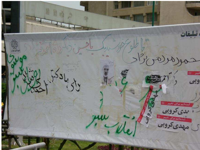
Figure 1. Campaign bulletin board provided by city hall.

Populist themes were central to the initial visual campaigns of the two main rivals. Ahmadinejad (the incumbent) used a socialist-realist-styled poster, while Mousavi (the opposition leader) from the beginning tried to revive themes from the 30-year-old Islamic revolution, fighting the tyrant through the story of the self-sacrifice of the third Shiite imam. Mousavi's first name, Mir Hossein, became synonymous with Imam Hossein. It was common to hear "Mir Hossein ya Hossein!" in public gatherings of Mousavi supporters. ( Mir refers to kinship with the Prophet Muhammad, similar to Seyyed , descendent of the prophet. Therefore, in this slogan, Mousavi's situation is equated to Imam Hossein and his fight for justice.