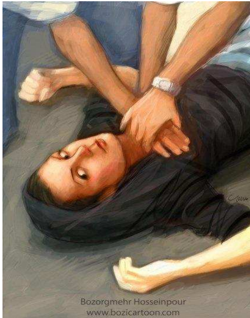
Figure 4. Image of Neda Agha Sultan rendered from mobile video.