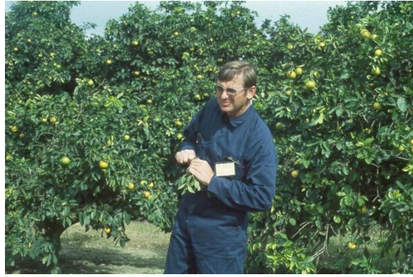
In the field