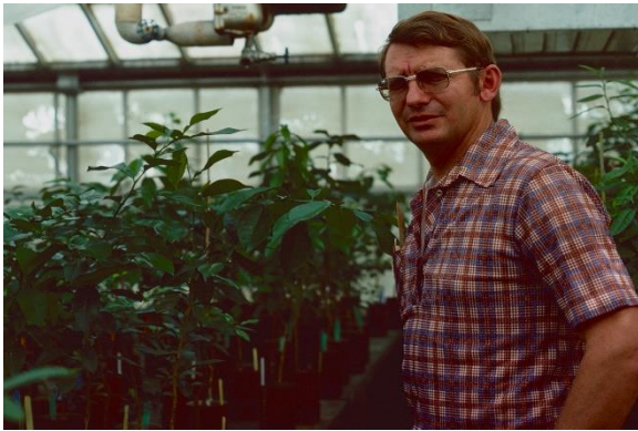
And the greenhouse