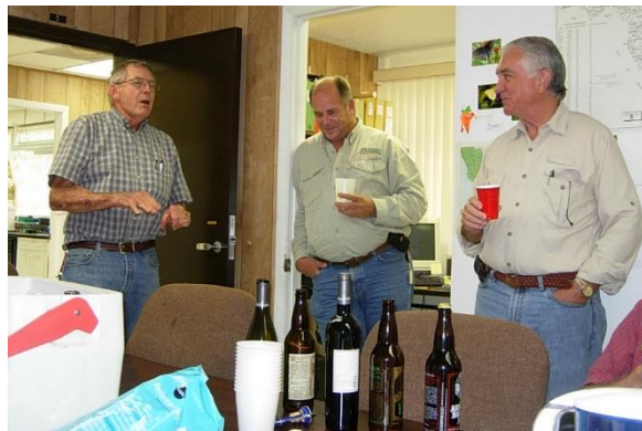
Making a long story short