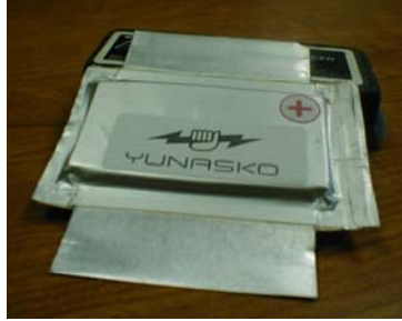
Figure 2: Yunasko Hybrid ultracapacitor 5000F device