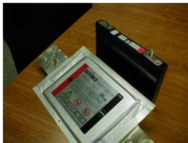
Figure 1: Photographs of the JM Energy 1100F and 2300F devices