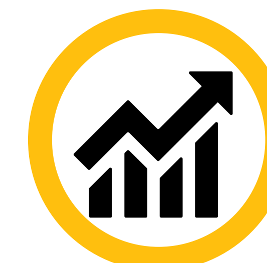
Tracking Application Outcomes