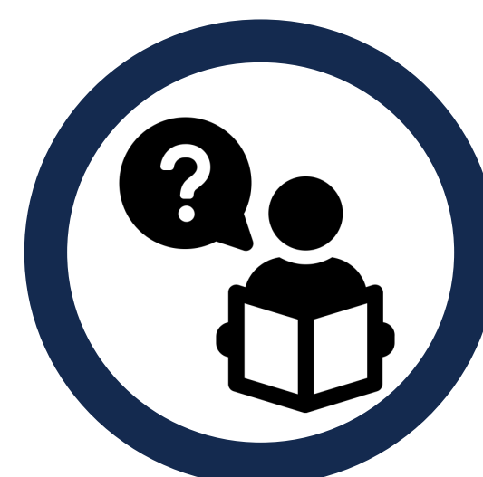
Lack of Knowledge/Resources