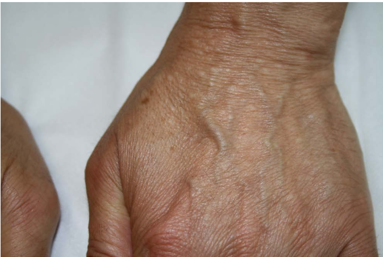
Figure 1. Flesh-colored to translucent papules, round and firm, on the back of both hands