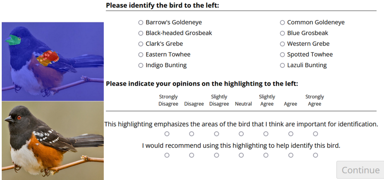
Figure 4: An example screen capture from the LIME vs. contrasting LIME study. Images were placed side-by-side for ease of comparison.

trials. Additionally, we compared overall bird species classification accuracy for LIME trials to averaged or contrasting LIME trials. Because accuracy may be a dubious measure of whether one is qualified to advise on useful annotations for bird identification, we did not use classification accuracy to exclude individual trials or participants. An experienced bird watcher may be aware that the shape of a white patch on the face of a common goldeneye or Barrow's goldeneye is a reliable method of distinguishing the two species. While a bird watcher may fail to accurately assign the round patch to the common goldeneye and the crescent patch to the Barrow's goldeneye (i.e. failure of the classification task), they remain knowledgeable on which areas of a bird are crucial for classification. Additionally, excluding trials with incorrect classifications did not result in a significant difference in the distribution of median ratings for any question; this is true for both studies (uncorrected p values of .7 or greater). This may be due to the consistently high classification accuracy across all participants.