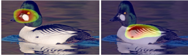
Figure 1: Heatmaps from GradCAM on the same image from two deep nets. It can be observed that entirely disparate areas of the bird are emphasized as important areas for classification.

(Selvaraju et al., 2017) analyze the activation of hidden units to visualizing the regions of input that are “important” for predictions from these models. Others, such as LRP (Binder et al., 2016) propagate relevance information from the output layer of the neural network to input layer to find the regions most responsible for activating the output.