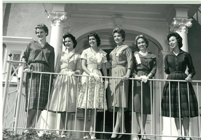
Kappa Kappa Gamma Sorority women standing outside their house in the 1950s 12

To discuss the Panhellenic community without acknowledging its long history of exclusion would be incomplete. Early sorority life at Cal was characterized by a lack of inclusivity and diversity. From their founding in the 19th century all the way to the 1960s, sororities were very exclusive spaces. Today, the Greek community has certainly come a long way from its elitist and predominantly white population and its historic exclusion of women of color and working-class backgrounds. 13 Over the years, many of Berkeley's Panhellenic chapters have fought to expand inclusion, even going so far as to directly oppose their national or local affiliation's policies. Even so, today the Greek community still remains often at the center of controversy for exclusivity and elitism.