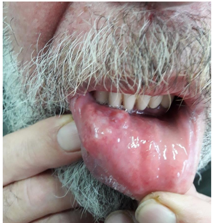
Figure 1. A 1.5 cm firm nodule located on the lower lip.

Histopathological examination showed well-differentiated tumor tissue growing in large solid sheets together with patchy cribriform areas ( Figure 2 ). Perineural invasion was present. Immunohistochemical examination showed positive staining with CK7, CKHMW (high molecular weight cytokeratin), CKLMW (low molecular weight cytokeratin), P63, vimentin, CD117, p40. EMA was focally positive; p53 showed 70-75% positivity and Ki67 was 25-30%. Computed tomography