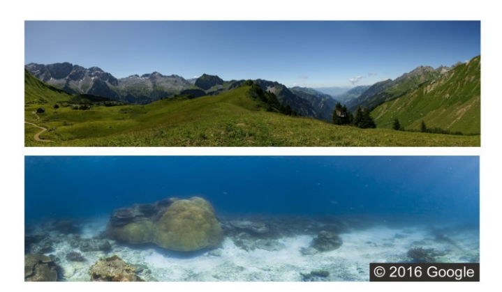
Figure 1: Above: Crop of panorama D (Dry) condition. Below: Crop of panorama W (Wet) condition.

Virtual environments were displayed on four walls of a 5.2 x 5.2 WorldViz CAVE using Unity 3D version 5.3.5, providing a 360-degree view. Eight short-range 120 Hz projectors provided 5.12 \times 2.75 meter projection of 2580 x 800 pixels per wall. Four cluster rendering workstations: Intel Xeon E5-1630 v3 3.70 GHz, 32 GB RAM, NVIDIA Quadro M6000, Windows 8.1 Pro 64-bit processed the synchronization of projections. Visual stimuli consisted of 2D panoramas of a mountainous landscape (D: Dry) and an underwater scene (W: Wet) (see Fig. 1). The resolution of both panoramas exceeded that of the total resolution of the four CAVE walls and were thus displayed at the highest possible level of visual quality.