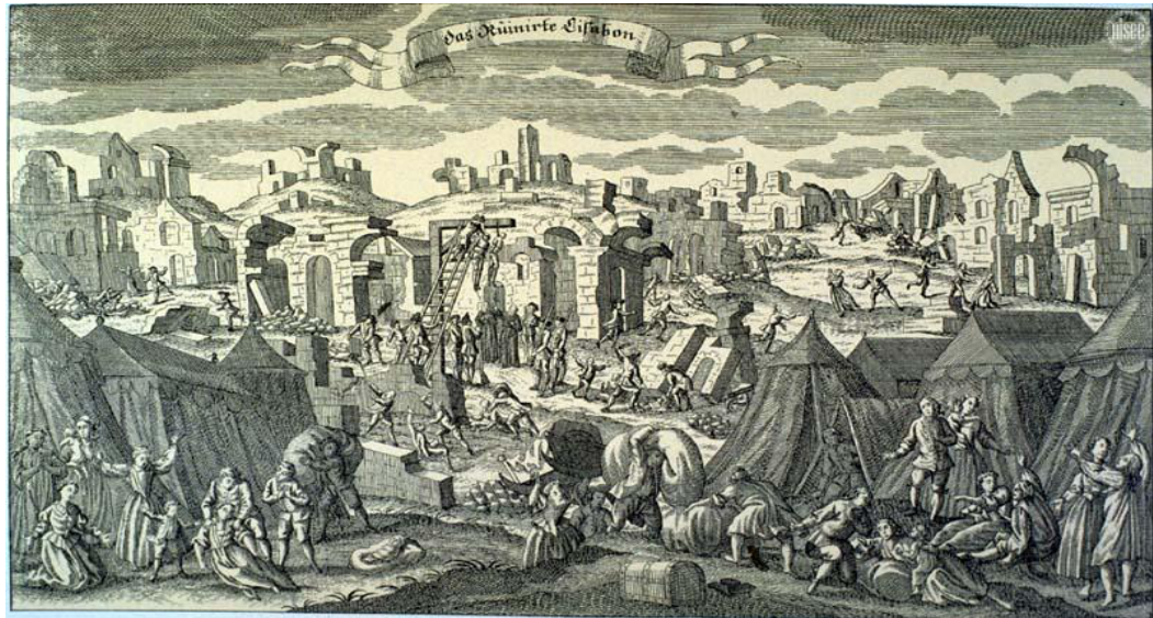
Figure 3 The Ruins of Lisbon, 1755, copperplate engraving. Original in Museu da Cidade, Lisbon. Museu da Cidade, Lisbon, also reproduced in O Teramoto de 1755, Testamunhos Britanicos ( The Lisbon Earthquake of 1755, British Accounts ). Lisbon: British Historical Society of Portugal, 1990.

matter overlap, and they begin and end at varying intervals. I argue that text and image can be conceptualized similarly. While the two mediums converge at the biennial salon exhibitions, Diderot envisioned his Salons living longer. Future readers could view and imagine the ancient art of eighteenth-century France, not least by the discovery of its “antiquities,” but also, and even more so, through the ancient author Denis Diderot’s powerful pen.