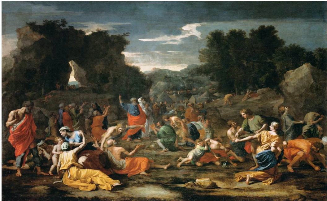
Figure 4 Nicolas Poussin, The Jews Gathering the Manna in the Desert , 1637, oil on canvas, Musée du Louvre, Paris. Public domain.

to the idea of “groups” and “masses,” Diderot proclaims, “In my view, the three women to the left . . . do not form a group . . . a group always forms a mass; but a mass does not always form a group” (Fig. 4). 51 Diderot describes for the readers the general subject of the painting, but he also lends insight into his own “view” about art, which may reflect broader eighteenth-century conceptions of composition. Taste, too, is also captured by Diderot’s pen. As he mentions, a “genuine imitator of nature, and the wise artist, will use groups economically.” 52 He continues, “an excessive propensity for groups indicates decadence in a painting.” 53 Diderot’s opinions fix an artwork’s meaning and allow a future reader to understand eighteenth-century taste, as he admits, whether his writing is “true or false, the reader can always garner something from [my thoughts].” 54 Writing about art, thus, was a useful conservation method because of its immutable possibilities, especially when a future audience’s taste and customs were presumably different.