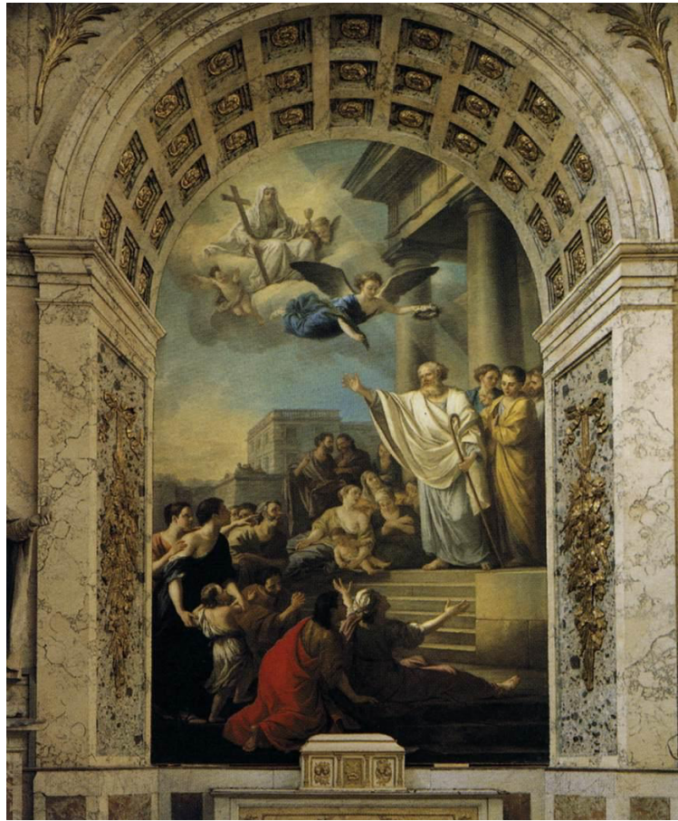
Figure 1 Joseph-Marie Vien, Saint Denis Preaching the Faith in France , 1767, oil on canvas, Musée Fabre, Montpellier. Public domain.

Diderot describes Vien's composition in lucid detail: the placement and disposition of bodies, the gesture of limbs, the relation of figures with one another, and so forth. He uses engaging language to stimulate the reader's attention. The narrator of his Salons , presumably Diderot, addresses the readers: "Let's have another look at this composition." The author also encourages the readers to critique the imagined painting, asking them, "But don't you think that with a bit of genius it would have been possible to introduce the most extreme movement?" Such rhetorical devices operate to insert a distant reader into the realm of looking and public discourse.