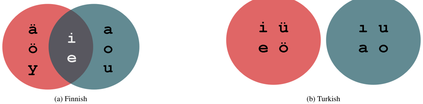
Figure 1: Venn diagrams showing basic vowel harmony systems of Finnish (left) and Turkish (right). All Turkish vowels harmonize, but the Finnish system includes two ‘neutral’ vowels which do not respond to or influence vowel harmony.

only operate on that phone and its neighbors. For instance in English, obstruents occupying the same syllable coda must share the same value for voicing. That is why ‘cats’ is pronounced /kæts/, but ‘dogs’ is pronounced /dɒgz/. The -s is voiced in the latter but not in the former in order to agree with the preceding obstruent. This pattern is local because it only operates over a fixed distance k from the phone in question ( k = 1 here). When another phone intervenes between the obstruents, as in /baksɪz/ ‘boxes,’ the constraint does not apply. That is not to say, however, that all phonotactics apply locally on the surface. They can apply locally on tiers as well. For example, vowel harmony applies between vowels and their nearest vowel neighbors regardless of how many intervening consonants there are. These interactions are still local over a fixed k distance because nearest vowels on the surface are adjacent vowels on the vowel-tier.