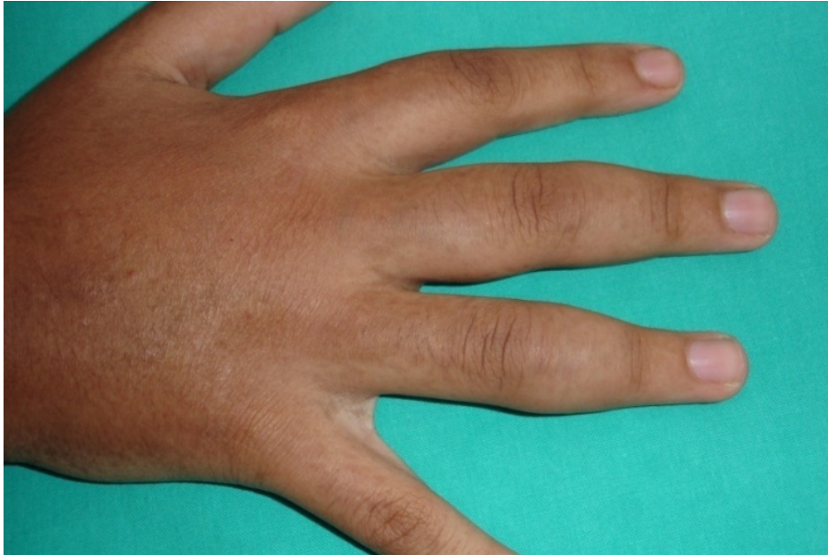
Figure2. Dactylitis with sausage-shaped fingers

Laboratory evaluation revealed only a non-specific rise in acute phase reactants. c-ANCA and p-ANCA were negative. Chest X-ray showed bilateral hilar lymphadenopathies, later confirmed by chest computed tomography. PPD (protein purified derivative) was negative. X-rays of the hands showed cortical erosions with periosteal reaction and trabecular aspect of metacarpal heads (Figure 3).