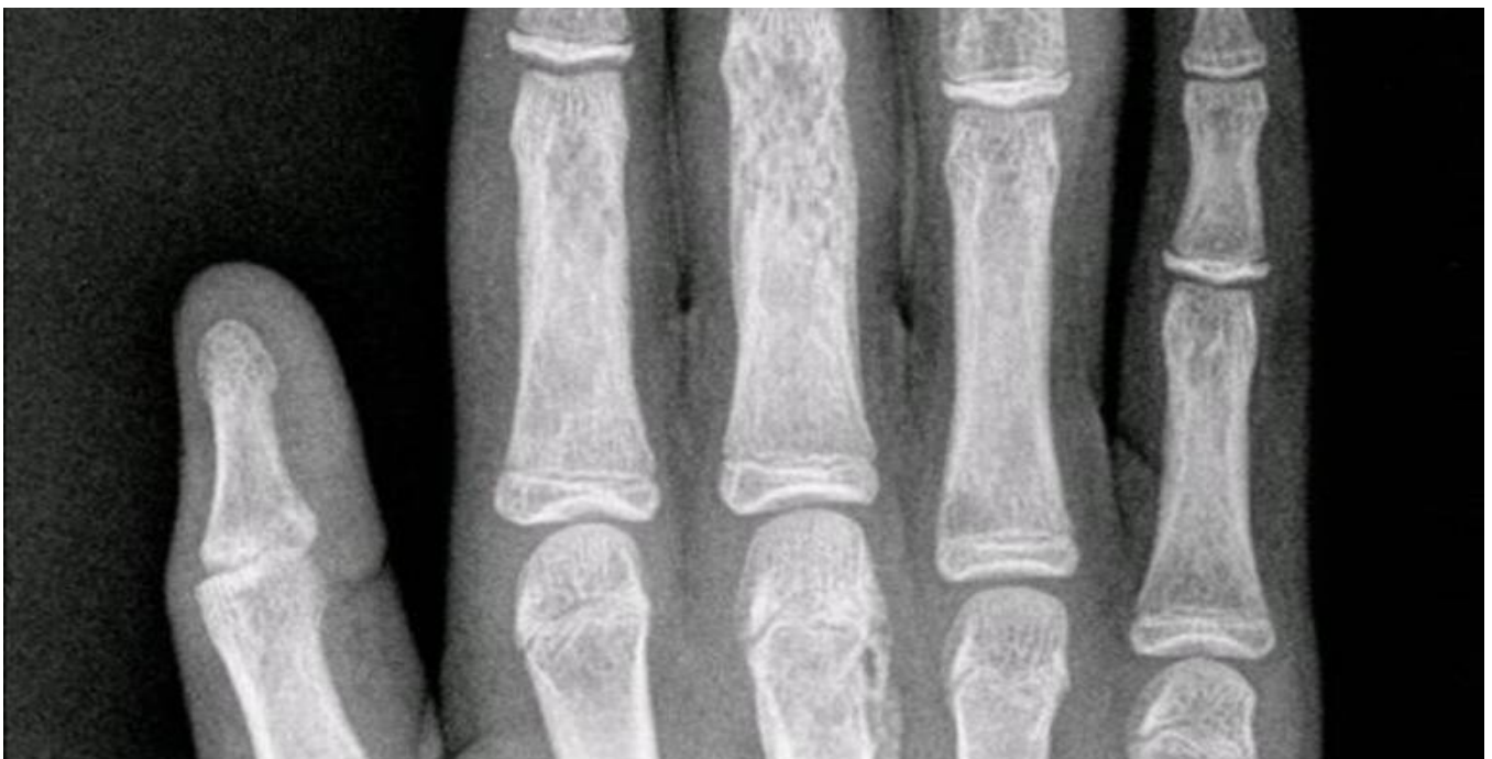
Figure3. Trabecular aspect of 3 rd and 4 th metacarpophalangeal joints and cortical erosions of 3 rd and 4 th proximal interphalangeal joints.

Based on clinical and histological findings, the diagnosis of childhood sarcoidosis was established. Treatment with prednisone 1mg/kg/day for 6 weeks was very effective in promoting complete healing of the cutaneous lesions, dactylitis, and adenopathies. Corticosteroid tapering was done over a period of 3 months without recurrence at 6-month follow-up.