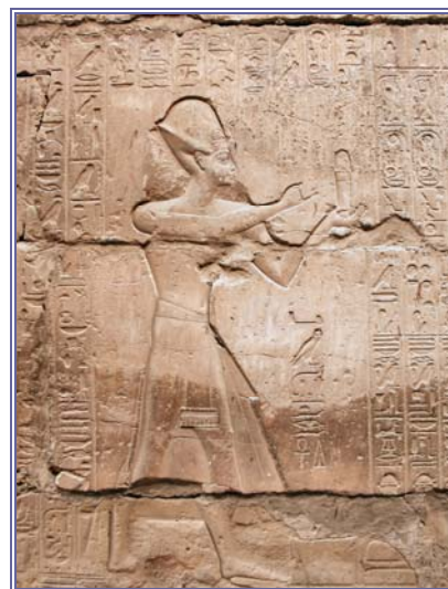
Figure 7. Ramesses II preparing to anoint the deity in Luxor Temple (19 th Dynasty).