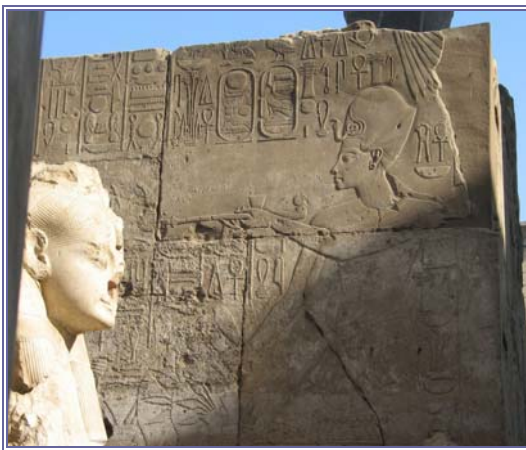
Figure 5. Tutankhamun burning incense in Luxor temple (18 th Dynasty).

and therapeutic effects of inhaling kyphi or even taking it in wine. He specifies a sun kyphi and a moon kyphi. Attempts have been made at recreating and marketing kyphi in modern times, but any claim to authenticity would stumble over lexicographical hurdles.