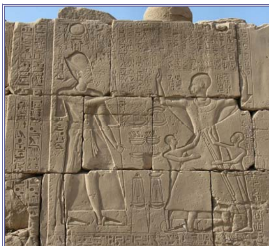
Figure 9. Rewarding of the high priest, Amenhotep, by Ramesses IX at Karnak.

with them leather skins specifically for removing the oils. Residue remains in the jars to this day, some with the fingerprints of the robbers who scooped out the contents. The elite in Egypt would include in their burials samples of the traditional seven sacred oils, and no doubt also larger containers, such as