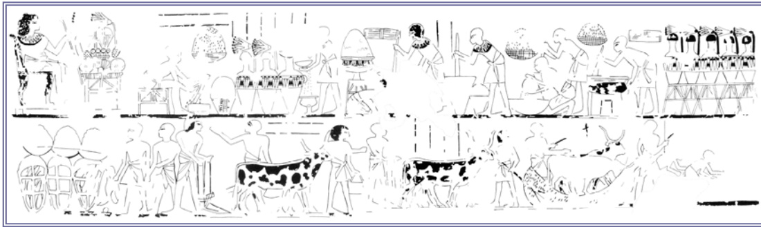
Figure 4. Preparation of scent in TT 175 at Thebes (18 th Dynasty).