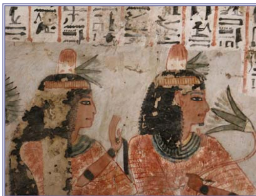
Figure 10. Couple with “unguent cones” and lotus flowers in TT 255 (19 th Dynasty).