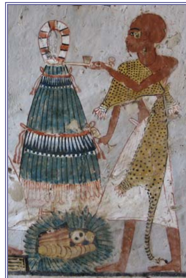
Figure 6. A priest burning incense in front of a deceased couple in TT 255 (19 th Dynasty).

Perfumed oils or fats were used for anointing the image of the deity during the daily temple ritual (fig. 7), and liquid resin was poured over offering tables (fig. 8). Perfume was also part of the “package” given by the king to worthy officials during reward ceremonies, along with golden necklaces and sometimes gloves (fig. 9). It played a major part in funerary beliefs for ordinary mortals as well as for royalty. Tutankhamun’s tomb contained some 350 liters of oils and fats, some in fanciful containers carved of calcite (alabaster). The value of this commodity can be appreciated by the fact that the second lot of robbers who entered the tomb brought