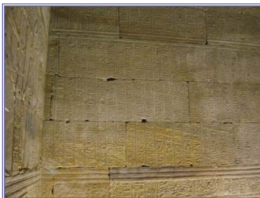
Figure 2. Recipes for scents as recorded in the “laboratory” of the temple of Edfu (Ptolemaic).