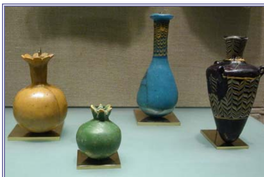
Figure 3. Glass perfume bottles in the Metropolitan Museum, New York (New Kingdom).

made astringent by adding herbs and spices. The recipes are meticulous in specifying quantities, especially of the reduction that would take place during cooking, which if done correctly, would have a pre-calculated end result (usually 1 hin , or 0.5 L).