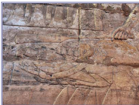
Figure 8. Pouring liquid scent over offerings in Luxor temple (18 th Dynasty).