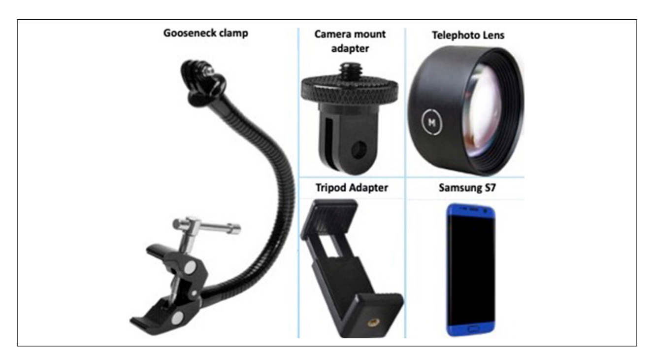
Figure 1. Consumer-grade parts for smartphone intraoperative recording arrangement.