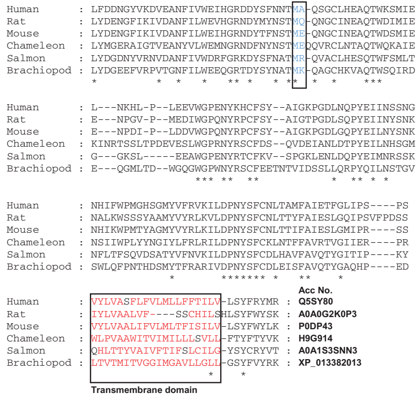
Figure 3 Alignment of a truncated region of CatSper-epsilon protein sequences (corresponding to 769aa–931aa of human CatSper-epsilon). Five selected evolutionary distant species were compared to the Human sequence using the EBI MUSCLE program. Stars (*) indicate conserved amino acids. The box with the blue lettering indicates the evolutionary conservation of the predicted deleted MA region in CatSper-epsilon of the patient 1 (p.Met799_Ala800del). The box containing red lettering illustrates a high density of hydrophobic amino acids that is the predicted transmembrane domain of the CatSper-epsilon orthologous proteins. The Uniprot or Genbank Accession numbers (Acc No.) for the different CatSper-epsilon proteins are given.

These initial observations show an association between a CatSper-epsilon variant and loss of CatSper channel function. Proof that this variant is the exclusive reason for the loss of channel function and fertilization competence will require further evidence. Generation of an equivalent CATSPERE mouse model is a conventional strategy and is potentially useful but a fundamental issue is that nothing is known