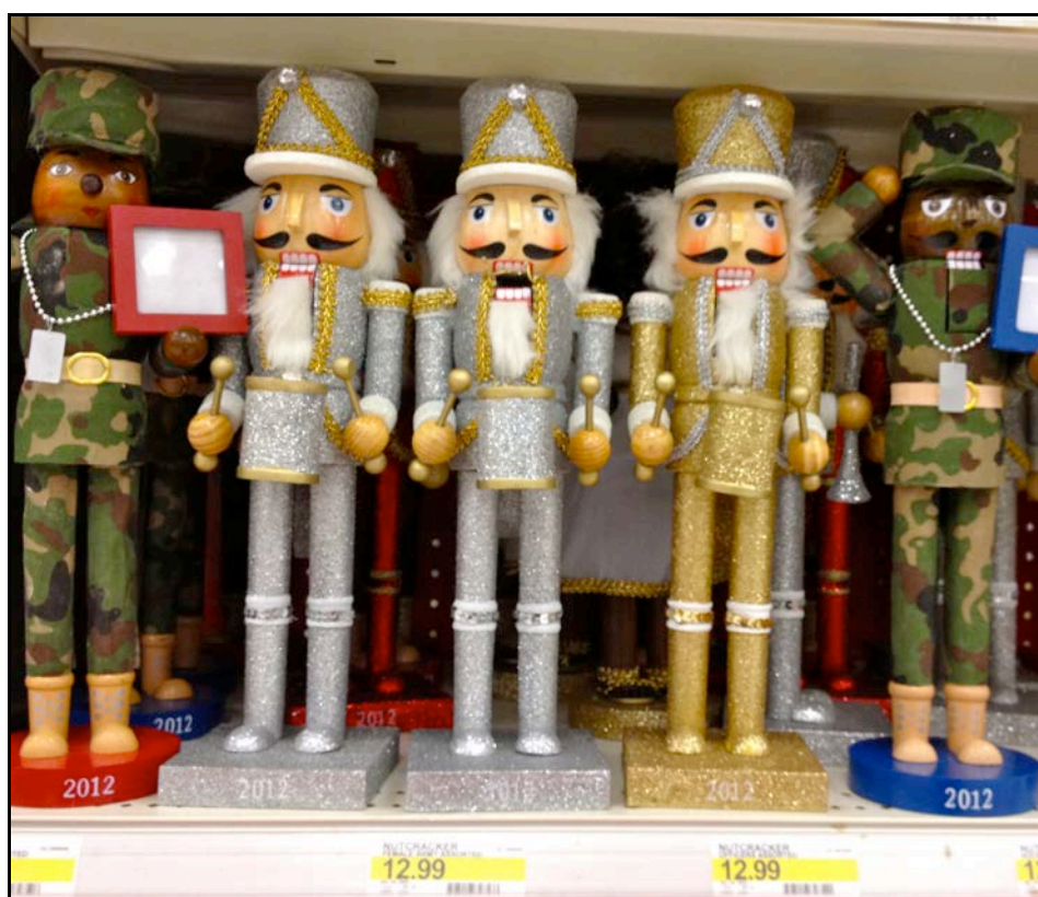
Figure 3. Holiday nutcrackers, Ithaca, New York.