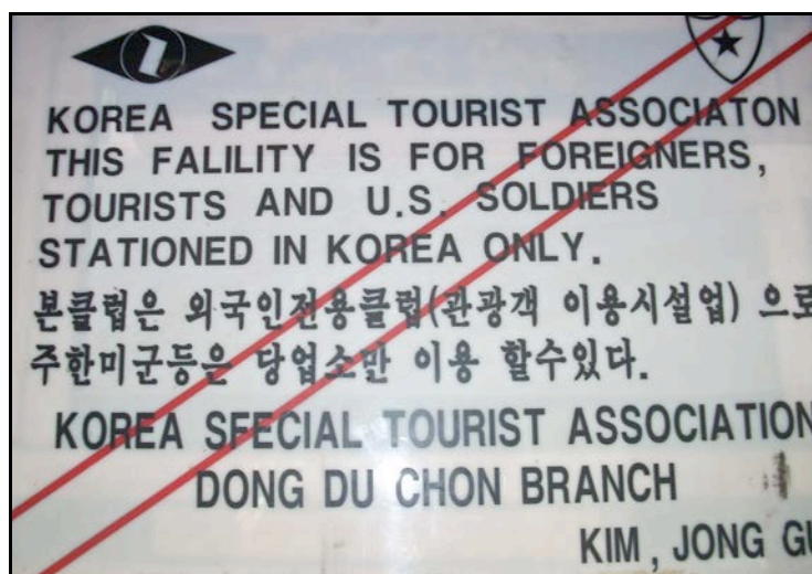
Figure 2. Korea Special Tourism Association Sign on Club Door in Camp Casey, South Korea.

Because illicit activities take place in the camptown, only some Koreans are willing to venture into it for possible economic benefit. The crossing is a literal and metaphorical one for these Koreans, and in some ways it involves a transformation—not only of language but also of behavior. People in such polluted spaces are seen as “transitional beings,” since they are neither one thing nor another or may be both (Turner 1967). Some are born as “transitional beings,”